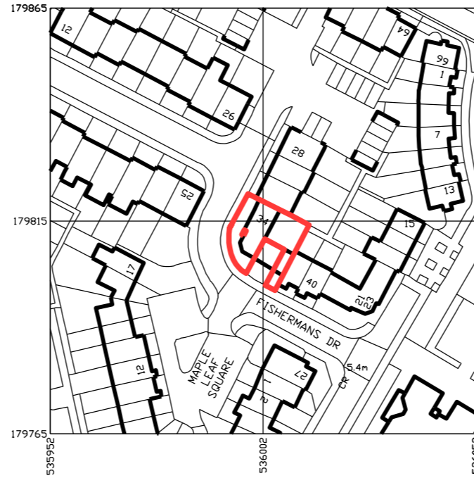
Site Location Plan 1:1250 @ A3

Copyright Studio Hatcham Architects LLP 2024