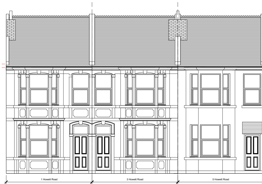
Existing West Elevation (front)

GENERAL NOTES This drawing is © SAND architects. Only scale from these drawings for Planning Approval purposes only. DO NOT SCALE for construction. Use figured dimensions only. All dimensions are in millimetres unless noted otherwise.