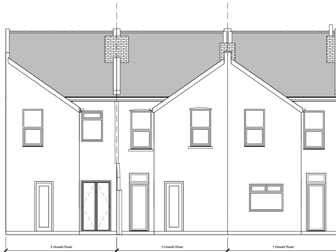
Existing East Elevation (rear)