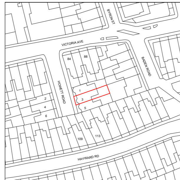
Existing Location Plan 1:1250