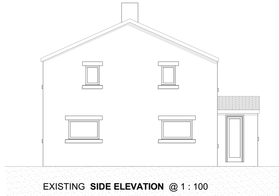
EXISTING SIDE ELEVATION @ 1 : 100