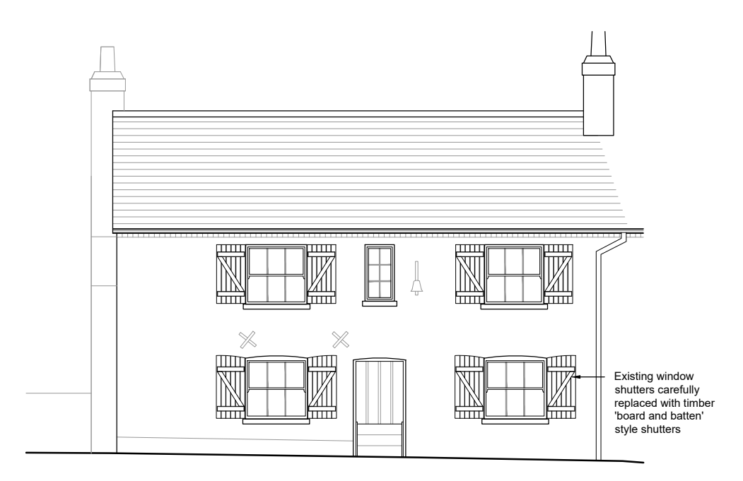
Proposed South Elevation