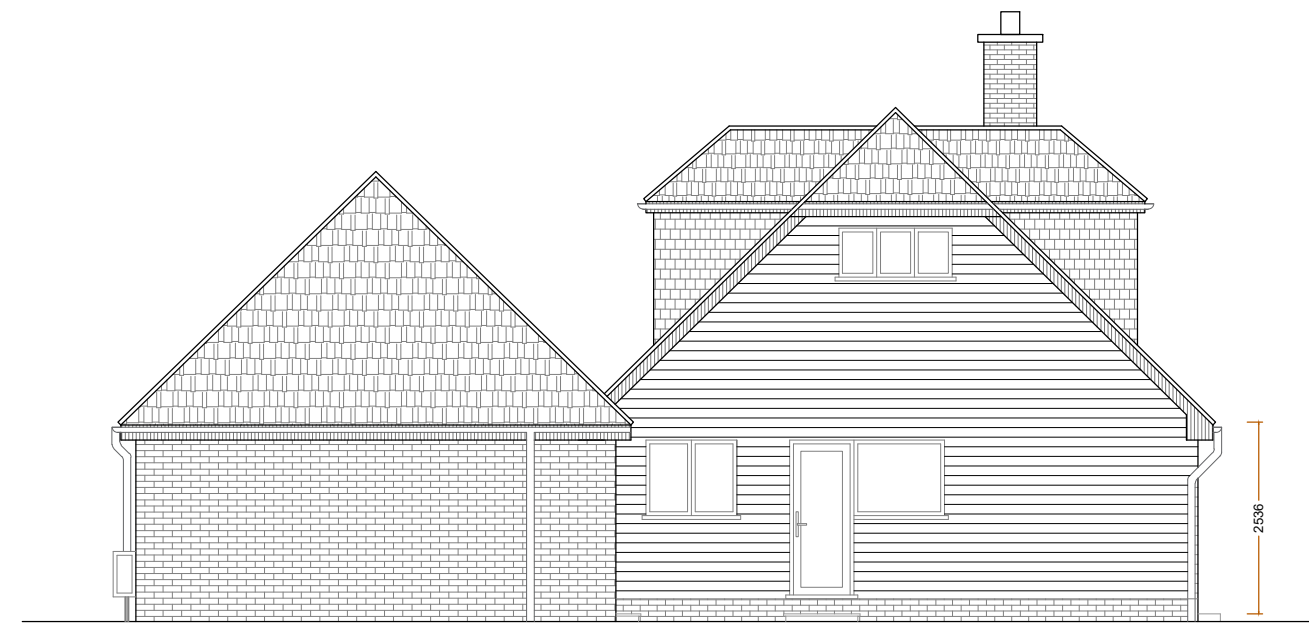
EXISTING SIDE ELEVATION-1