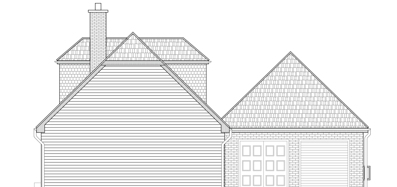
EXISTING SIDE ELEVATION-2