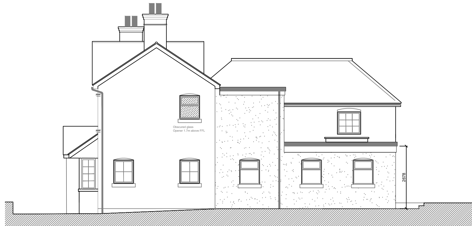
Proposed side elevation