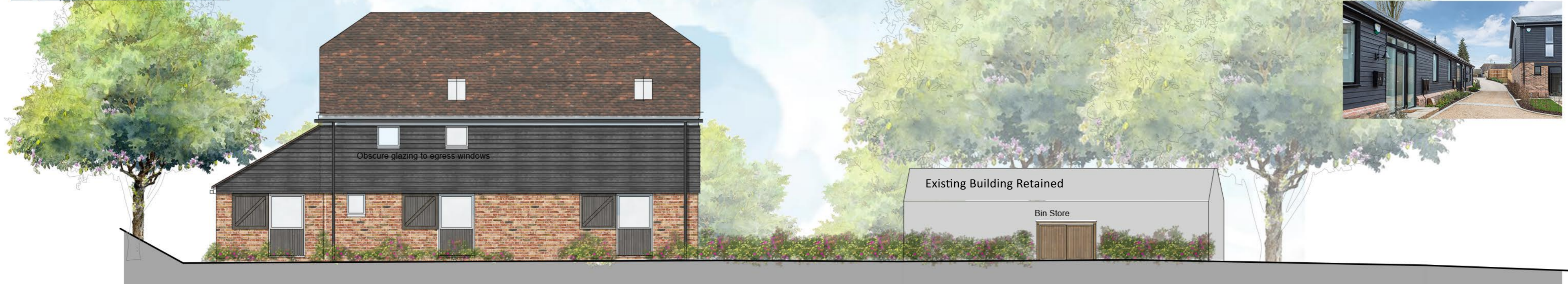
South East Elevation as Proposed 1:100