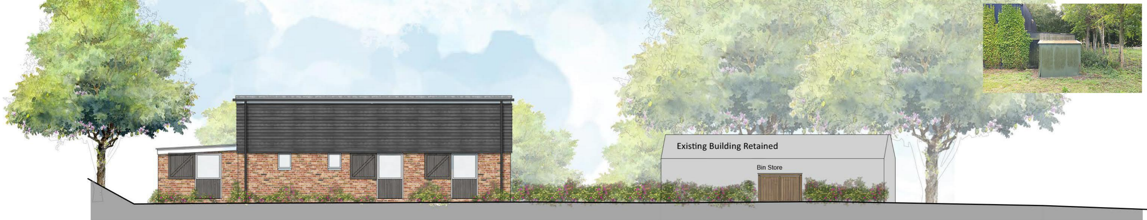
South East Elevation as Approved 1:100