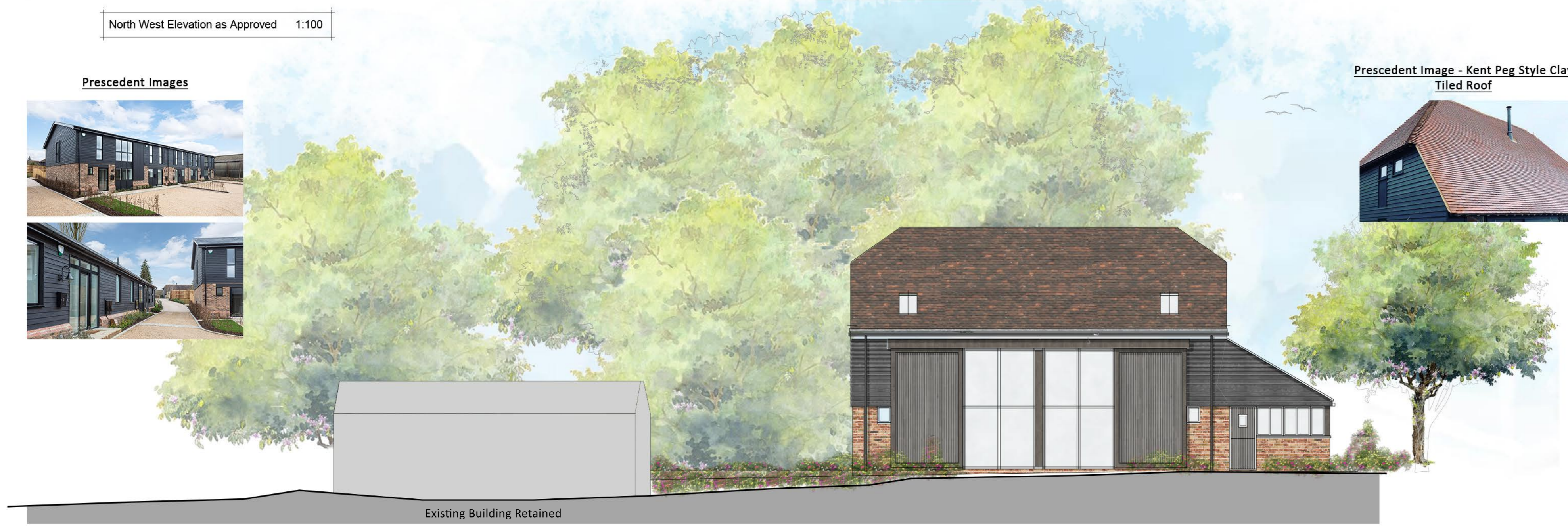
Existing Building Retained