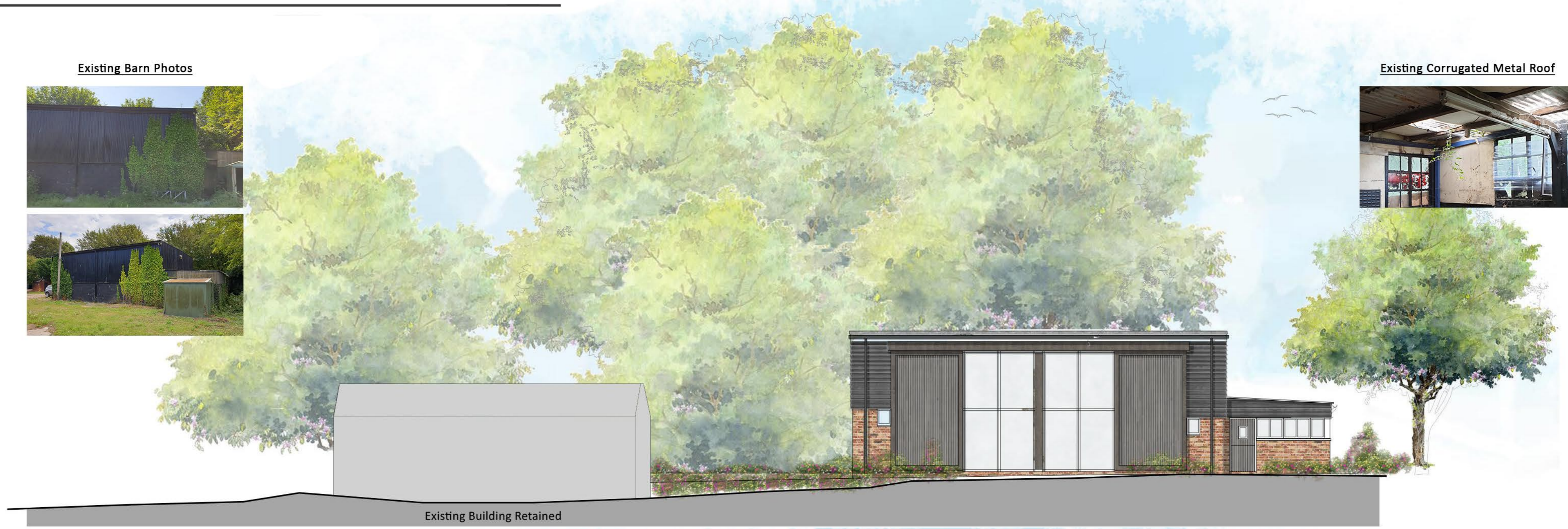
Existing Building Retained