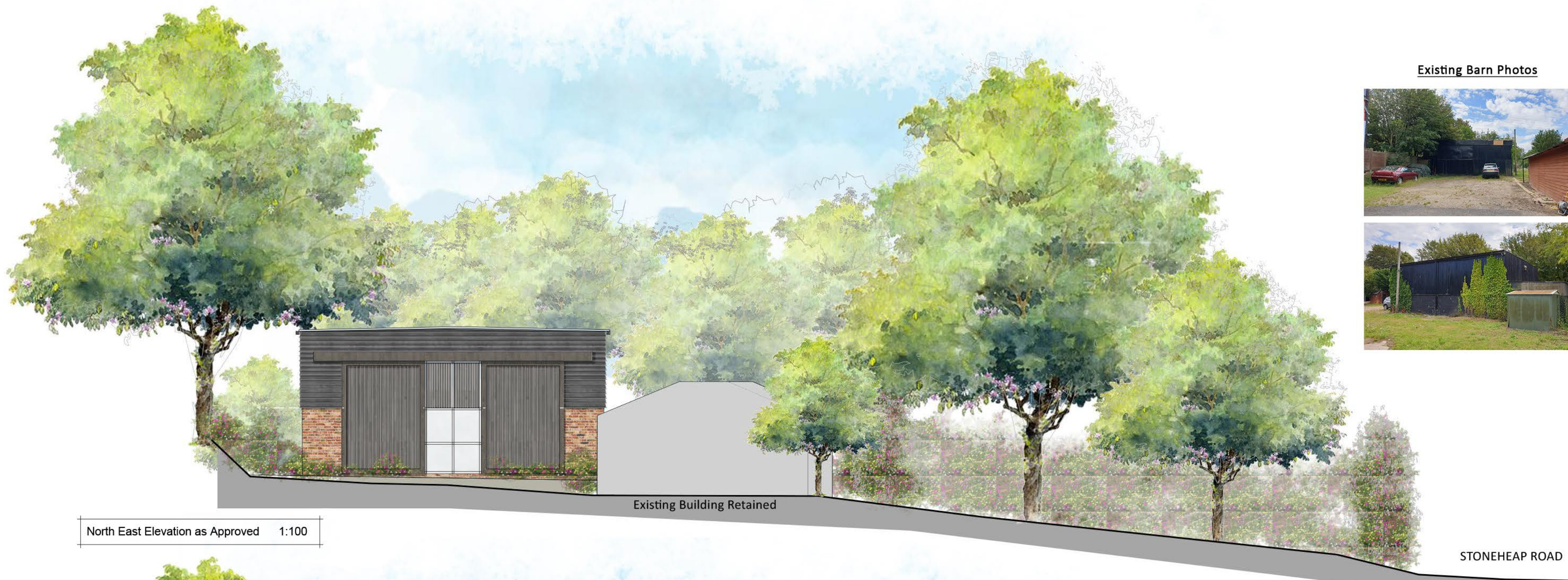
North East Elevation as Approved 1:100