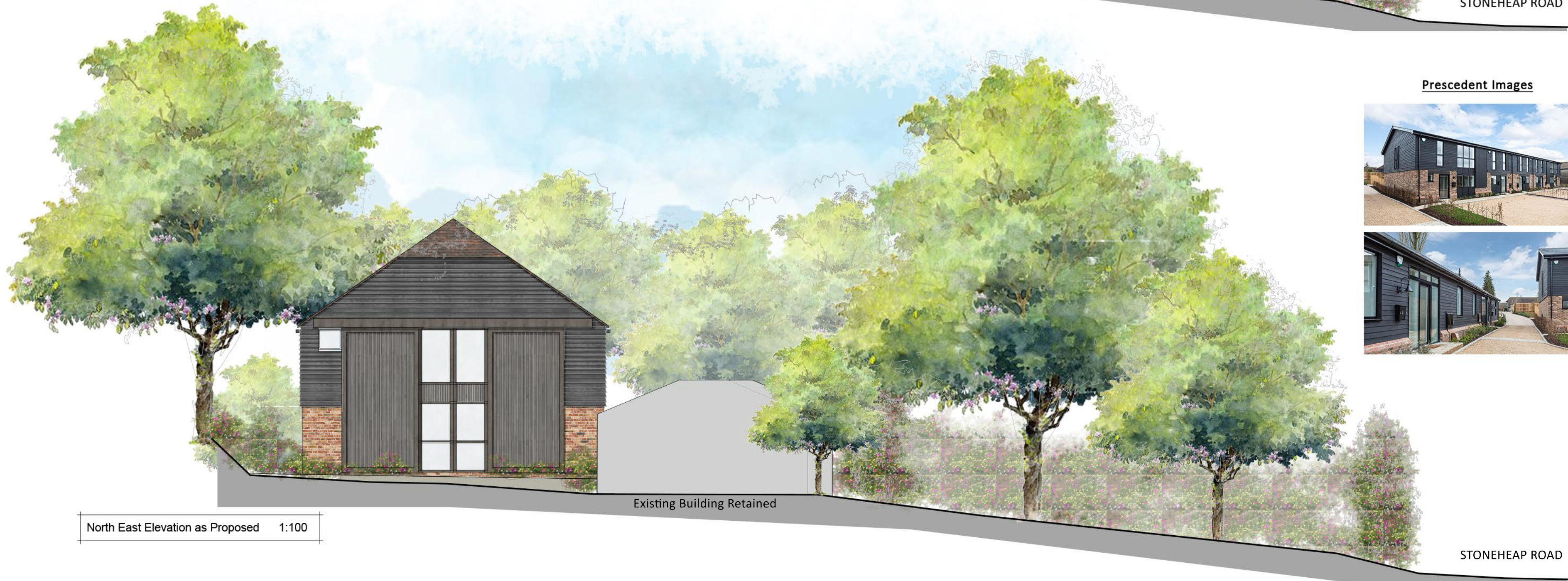
North East Elevation as Proposed 1:100