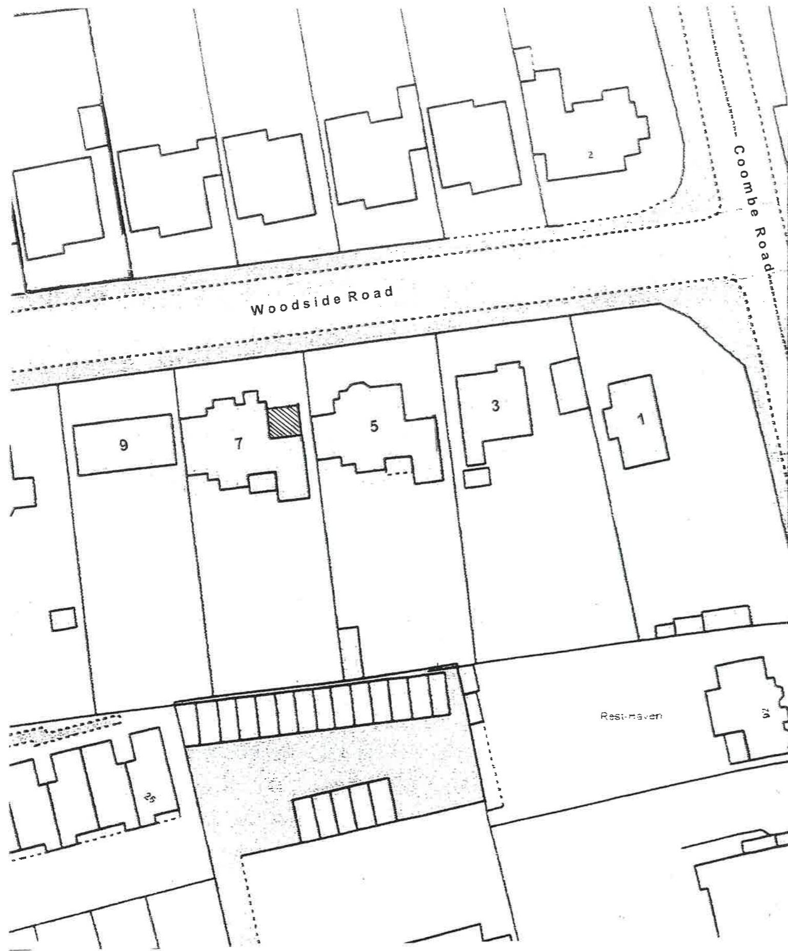
BLOCK PLAN 1.500