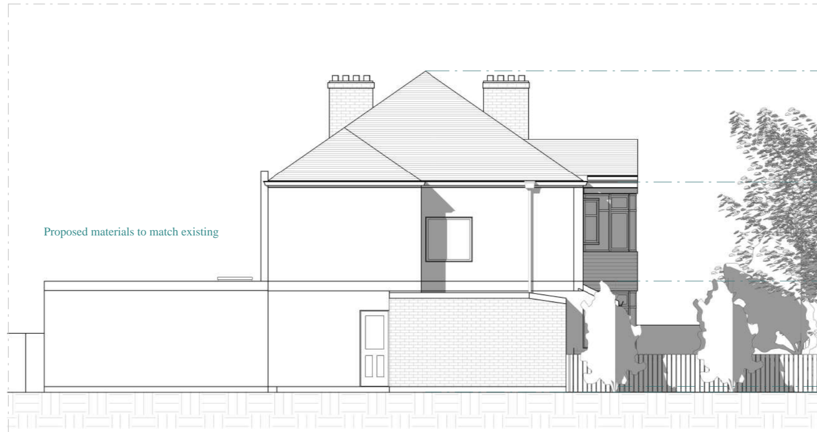
PROPOSED LEFT ELEVATION