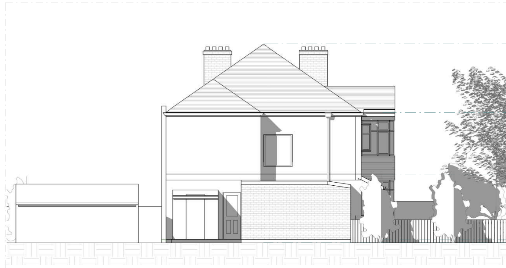
EXISTING LEFT ELEVATION