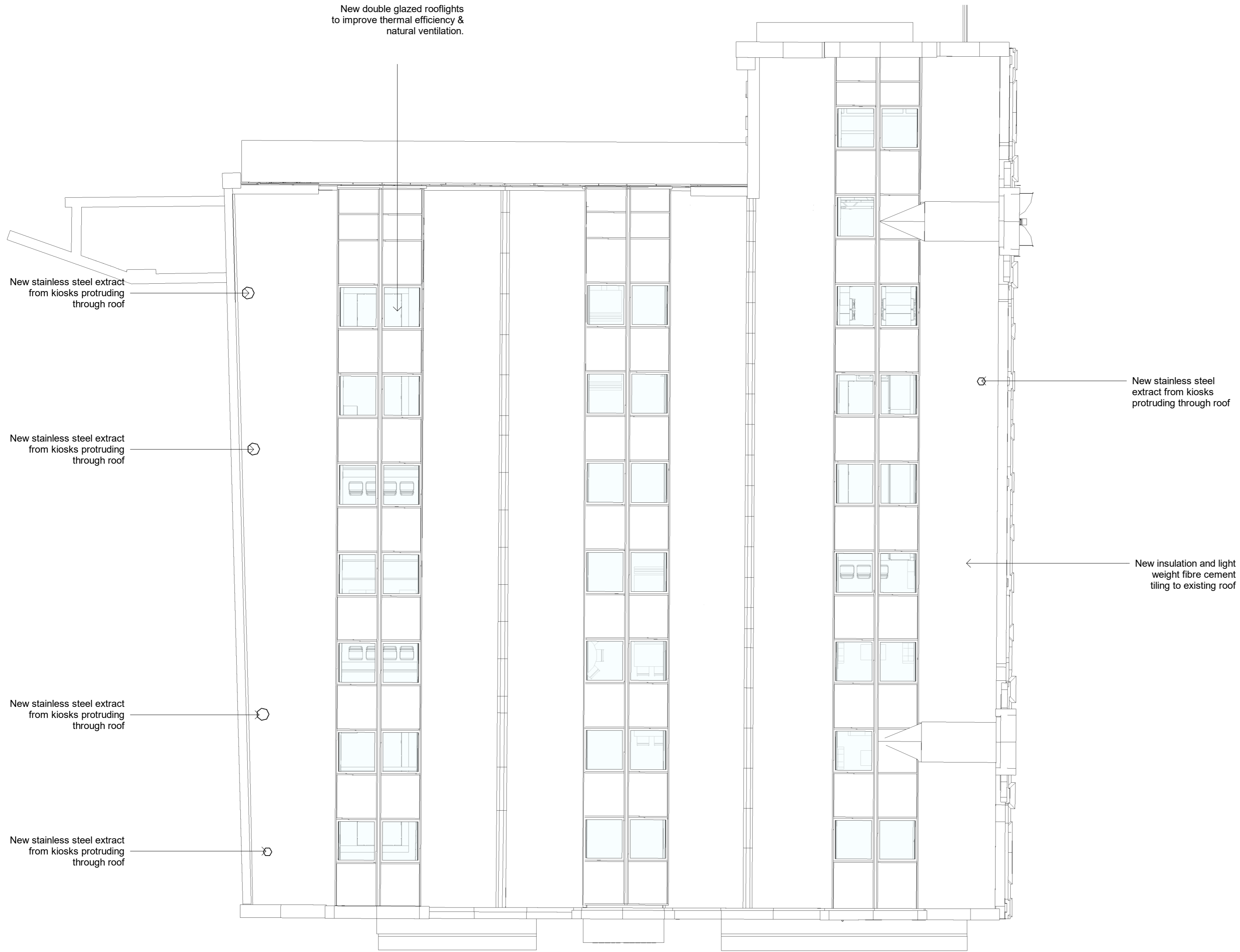
Proposed - Roof Plan 1 : 100