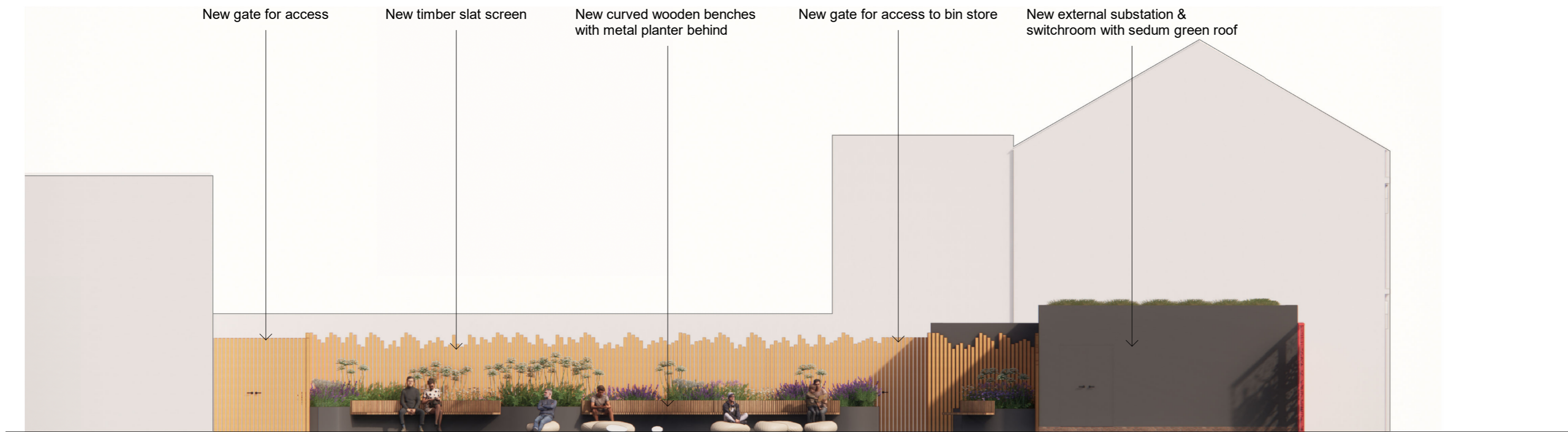
Proposed - Back Garden North Elevation 1 : 100