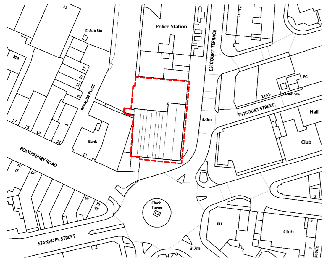
1 Existing - Location Plan 1 : 1250