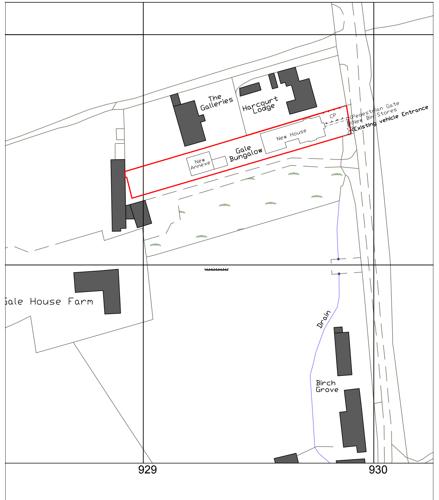
2 Proposed Site Plan | 1:1000@A3