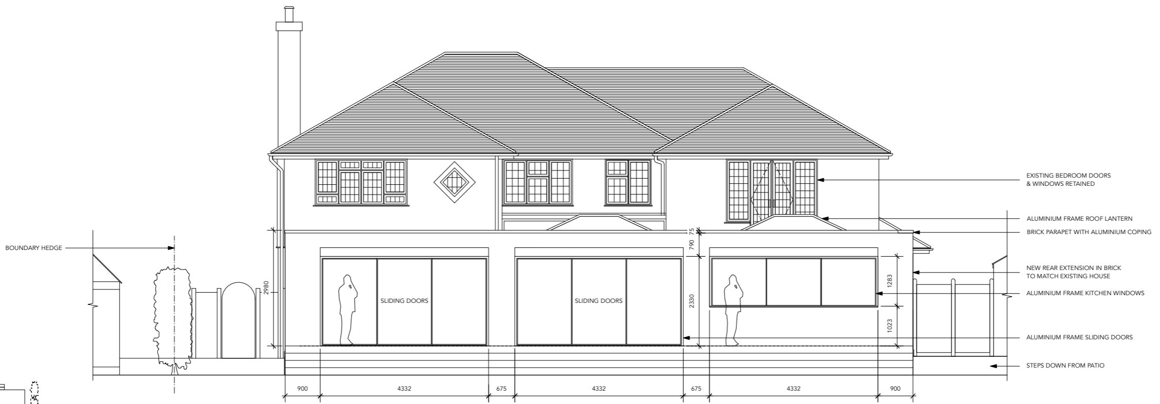
PROPOSED REAR ELEVATION B SCALE 1:50@A1/1:100@A3