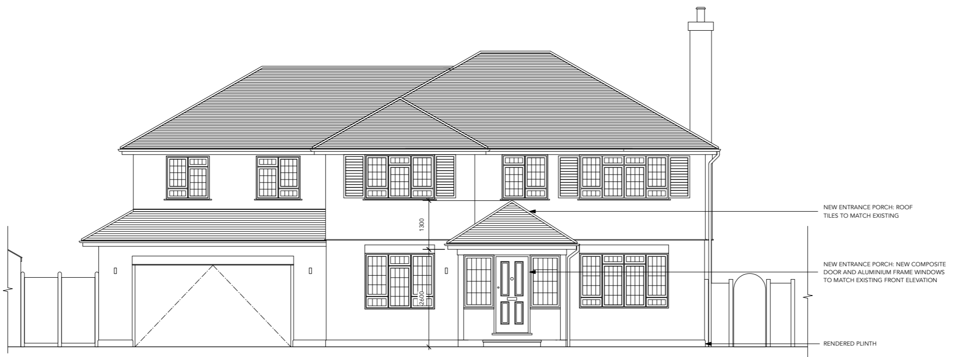
PROPOSED FRONT ELEVATION A SCALE 1:50@A1/1:100@A3

Notes: This drawing should not be scaled. The contractor is to verify all dimensions and conditions on site. This drawing is the property of Jack Architecture & Design Ltd and they reserve the copyright. It is issued on the understanding that it will not be copied, reproduced or disclosed in whole or in part to any unauthorised party without written permission from Jack Architecture & Design Ltd.