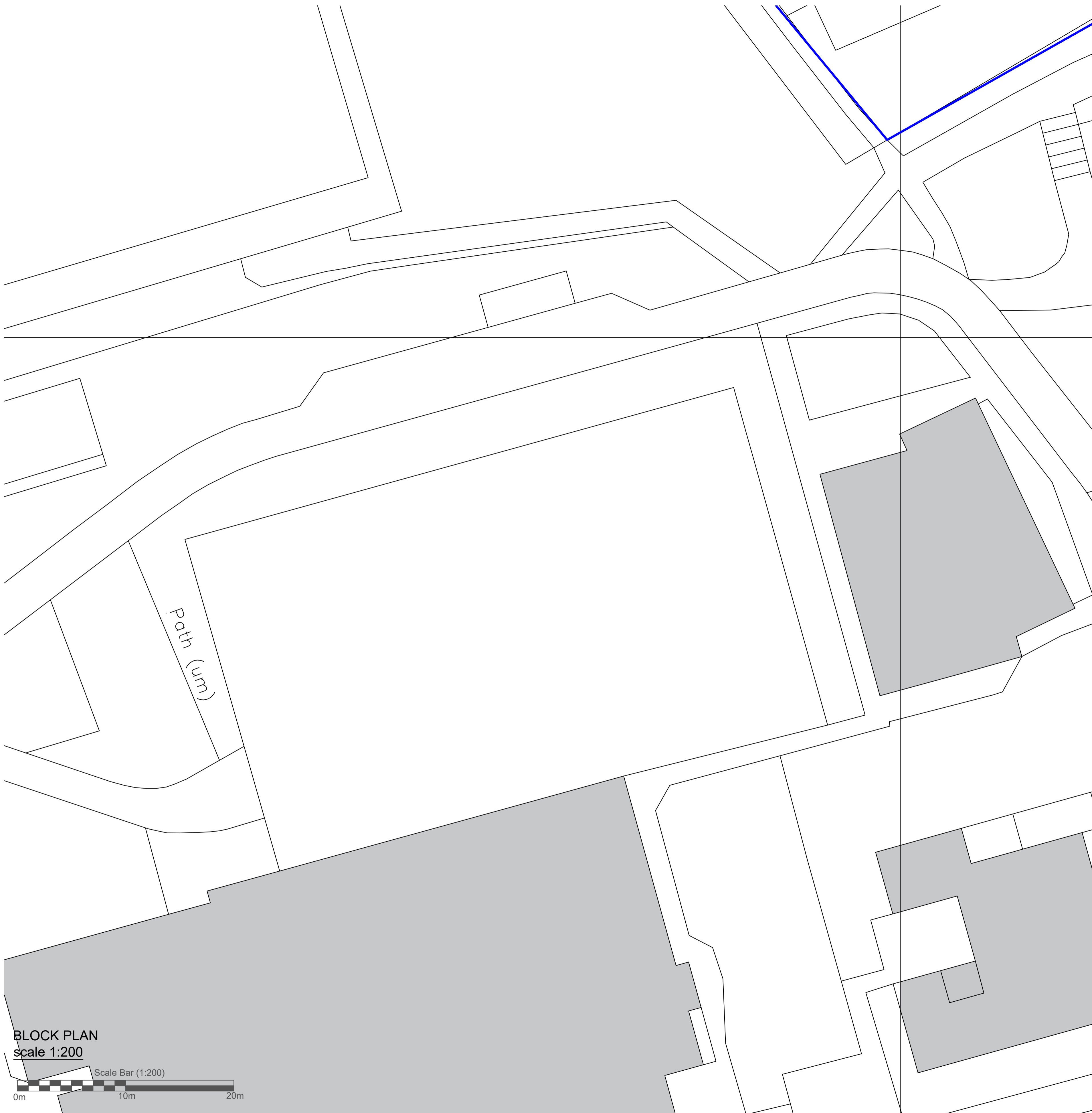
BLOCK PLAN scale 1:200 Scale Bar (1:200) 0m 10m 20m