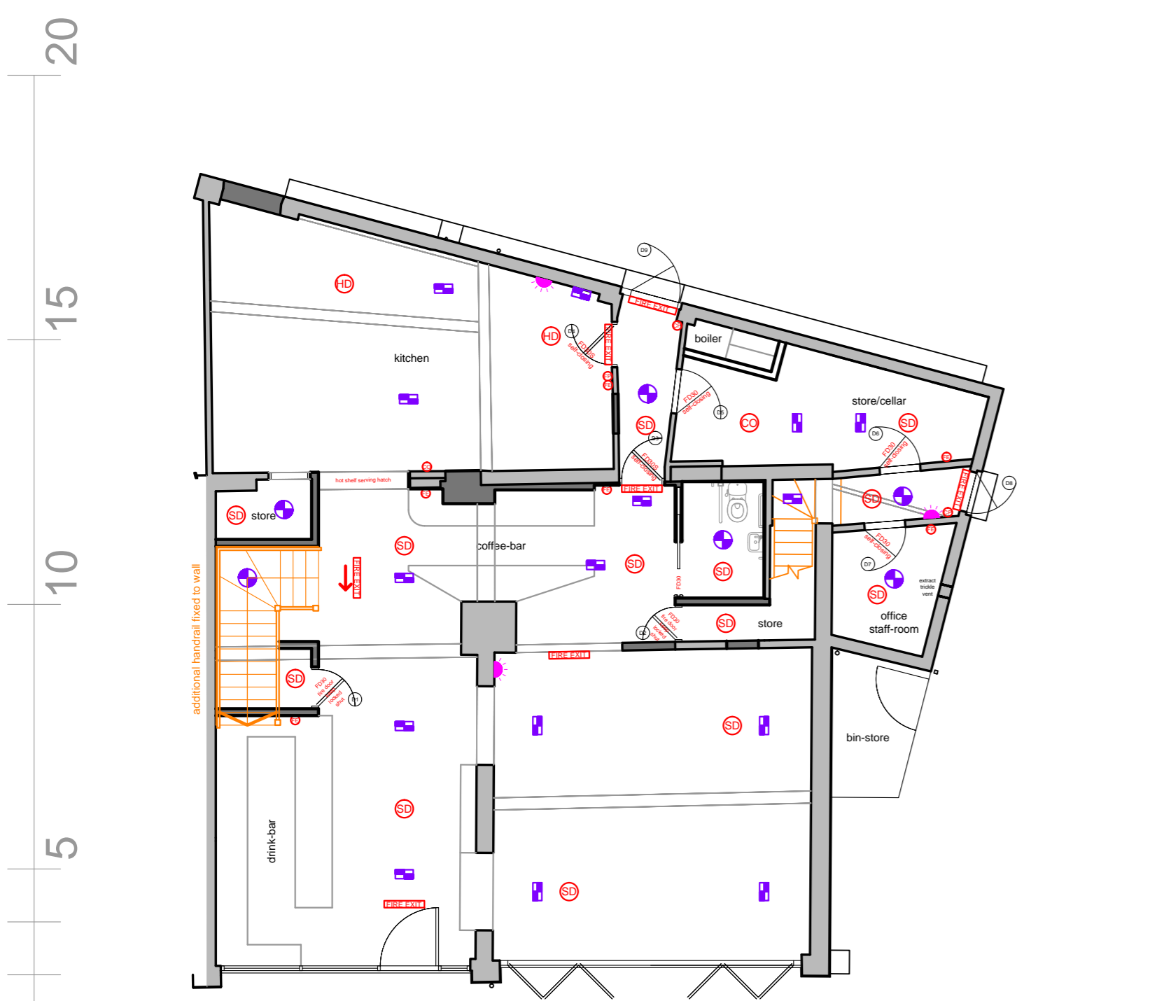
ground floor plan