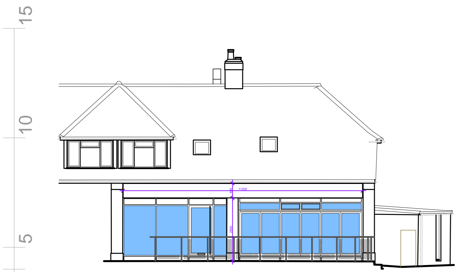
Front Elevation Datum 49.00m