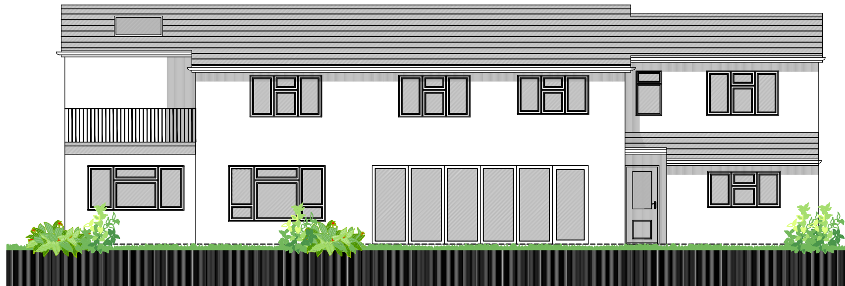
SOUTH WEST ELEVATION AS EXIST.