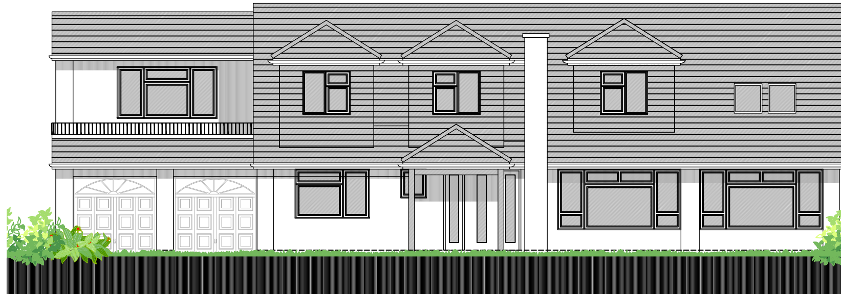
NORTH EAST ELEVATION AS EXIST.

THIS DRAWING IS FOR PLANNING PURPOSES ONLY THIS DRAWING IS BASED UPON SURVEY INFORMATION DRAWN BY OTHERS. ALL CRITICAL DIMENSIONS TO BE CHECKED ON SITE.