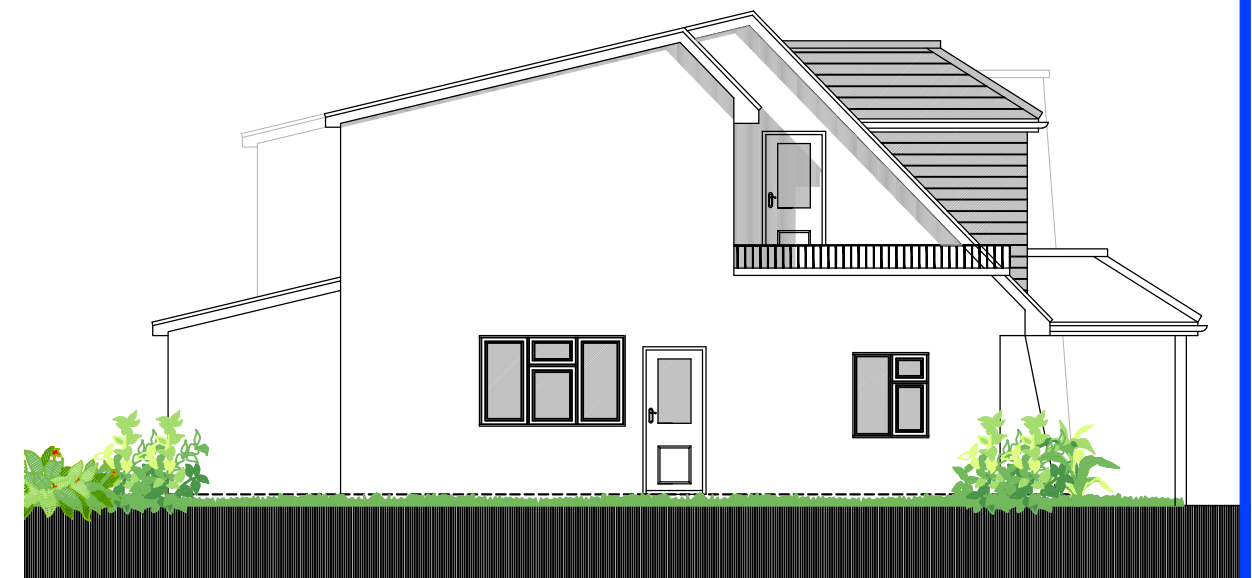
NORTH WEST ELEVATION AS EXIST.