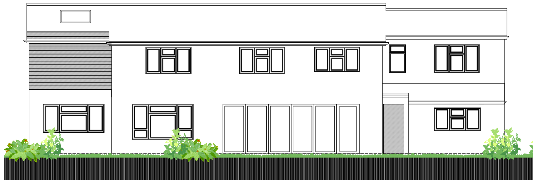
SOUTH WEST ELEVATION AS PROP.