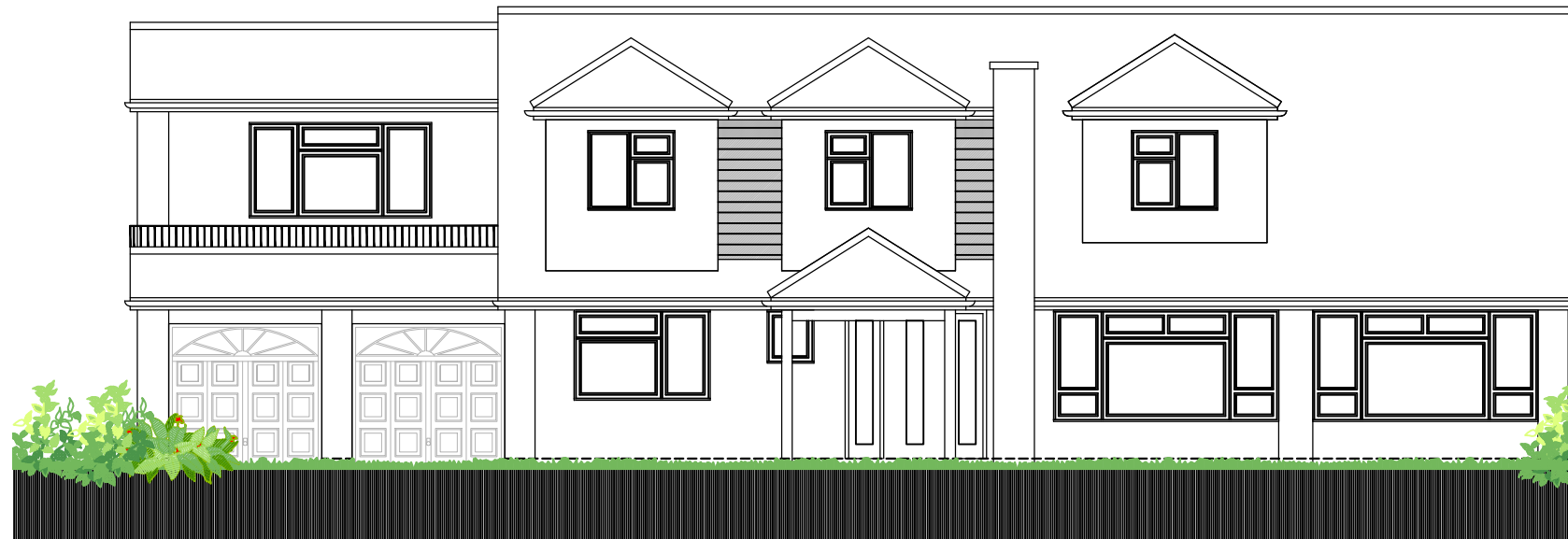
NORTH EAST ELEVATION AS PROP.

THIS DRAWING IS FOR PLANNING PURPOSES ONLY THIS DRAWING IS BASED UPON SURVEY INFORMATION DRAWN BY OTHERS. ALL CRITICAL DIMENSIONS TO BE CHECKED ON SITE.