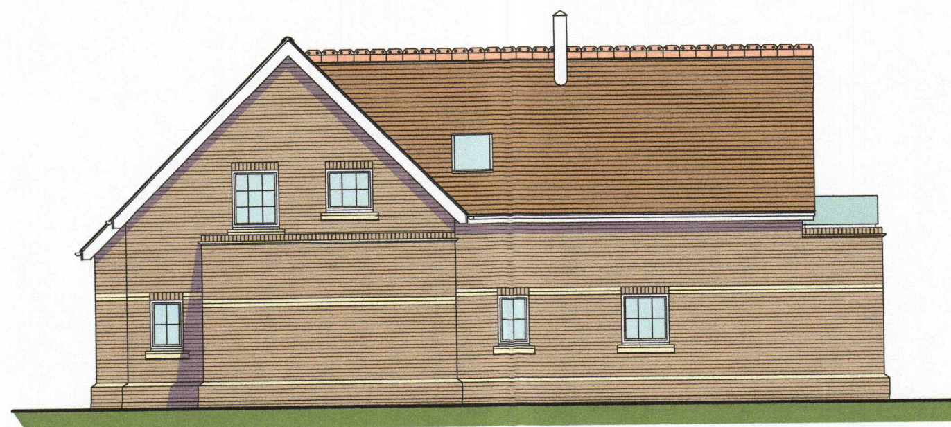
South West Elevation