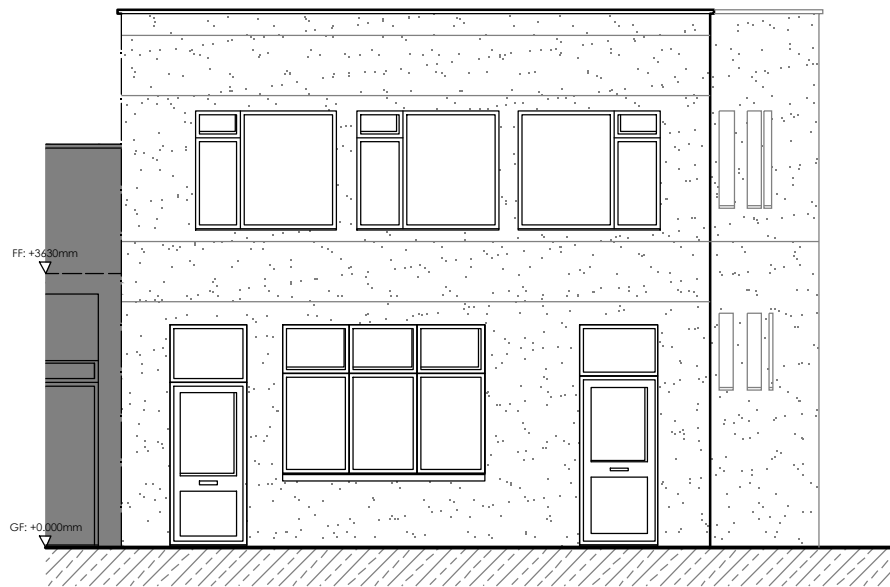
EXISTING FRONT ELEVATION 1:100 (AS APPROVED WITH APPLICATION P23/03449/PNMD)

The owner, should they need to do so under the requirements of the Party Wall Act 1996, has a duty to serve a Party Structure Notice on any adjoining owner if building work on, to or near an existing Party Wall involves any of the following: • Support of beam • Insertion of DPC through wall • Raising a wall or cutting off projections • Demolition and rebuilding • Underpinning • Insertion of lead flashings • Excavations within 3 metres of an existing structure where the new foundations will go deeper than adjoining foundations, or within 6 metres of an existing structure where the new foundations are within a 45 degree line of the adjoining foundations. A Party Wall Agreement is to be in place prior to start of works on site.