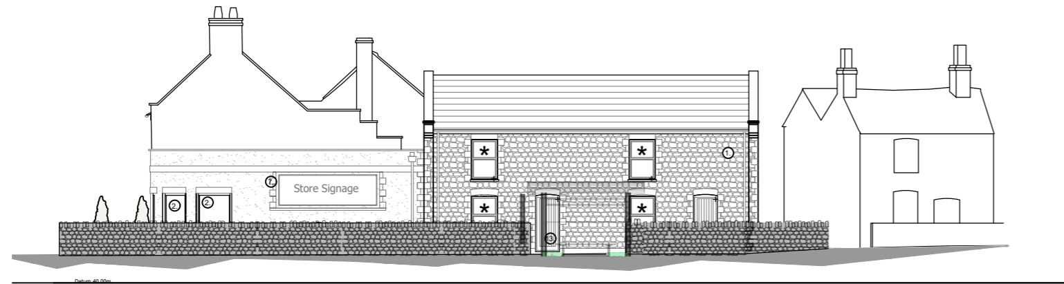
PROPOSED NORTH ELEVATION AND STREETSCENE

GENERAL NOTES: 1. THIS DRAWING IS TO BE READ IN CONJUNCTION WITH THE OTHER RELEVANT CONSULTANTS DRAWINGS. 2. ALL FINISHES ARE TO CONFORM TO THE CURRENT BUILDING REGULATIONS. 3. REFER TO A SEPARATE DOCUMENT FOR THE DESIGNERS RISK ASSESSMENT. 4. ALL WORKS OR MATERIALS INDICATED ON THIS DRAWING ARE TO BE TO THE LATEST RELEVANT BRITISH STANDARDS AND CARRIED OUT IN ACCORDANCE WITH THE BRITISH STANDARDS CODES OF PRACTICE OR RECOGNIZED INSTITUTE OR TRADE ASSOCIATION RECOMMENDATIONS AND PUBLICATIONS.