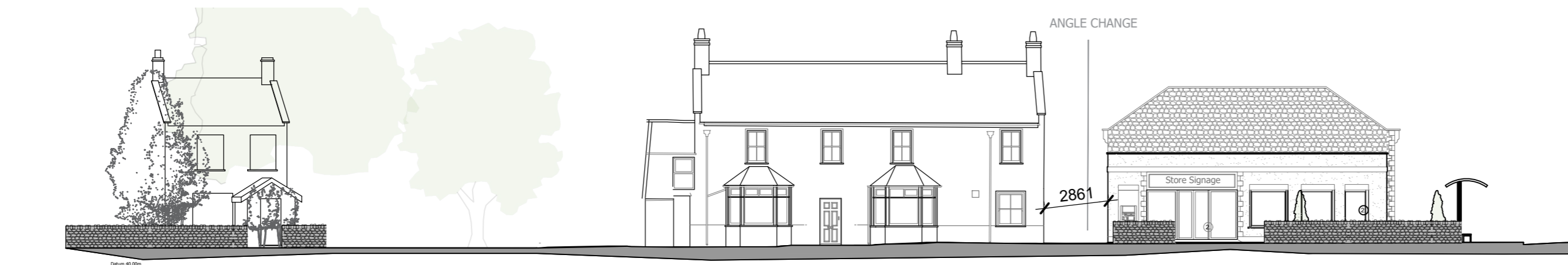
PROPOSED EAST ELEVATION AND STREETSCENE