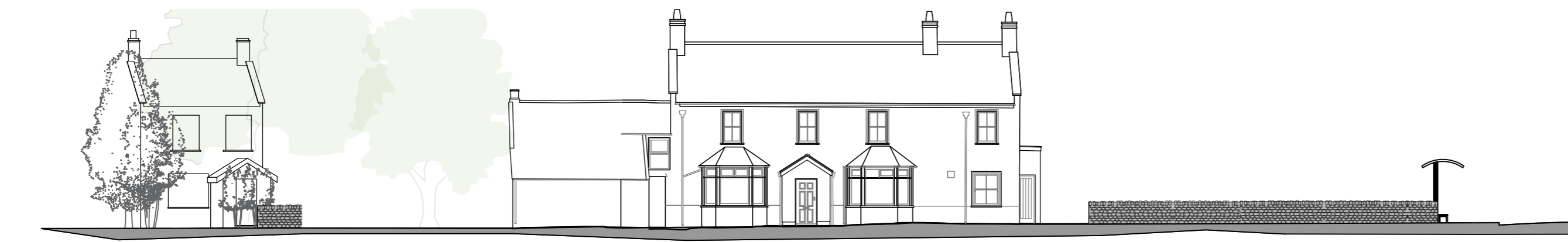
EXISTING EAST ELEVATION AND STREETSCENE