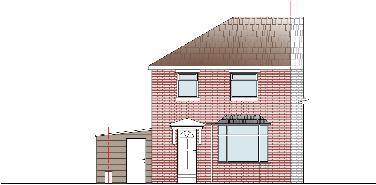
FRONT ELEVATION Sc.1:100