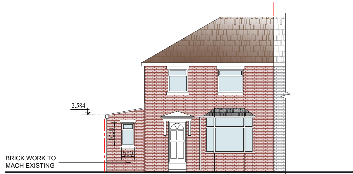
FRONT ELEVATION Sc.1:100