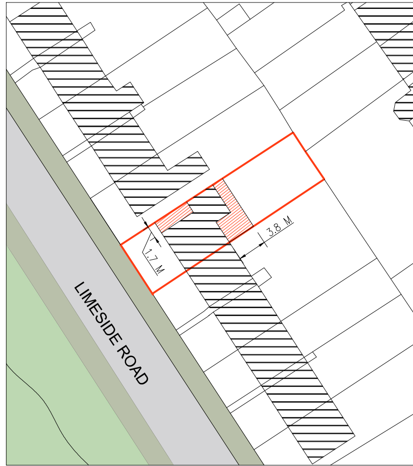
PROPOSED BLOCK PLAN SC.1:100