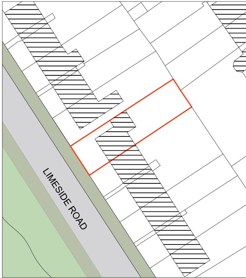
EXISTING BLOCK PLAN SC.1:100