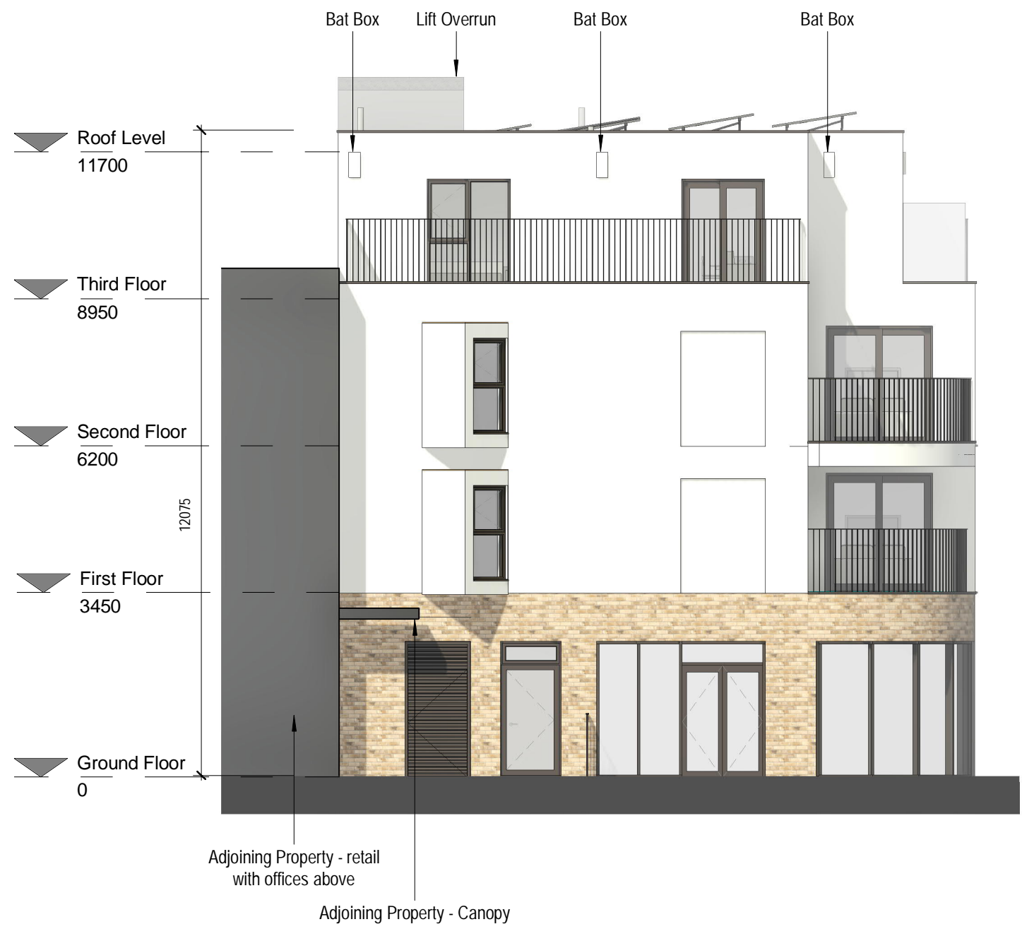
1 East Elevation 1 : 100

PLANNING NOTES 1. THIS DRAWING IS COPYRIGHT AND MUST NOT BE REPRODUCED IN WHOLE OR IN PART WITHOUT WRITTEN PERMISSION OF GAA DESIGN. 2. THIS DRAWING REPRESENTS DESIGN INTENT AND CONCEPT ONLY. HENCE IT CAN BE SCALED FOR PLANNING PURPOSES ONLY. 3. THIS DOCUMENT AND ALL ASSOCIATED DOCUMENTS ARE PREPARED FOR SPECIFIC SITE AND EVENT AND INCORPORATE CALCULATIONS AND MEASUREMENTS AVAILABLE FROM THE CLIENT AT THE TIME OF DRAWING. 4. THE RECIPIENT AGREES TO PROTECT THE CONTENTS FROM DISTRIBUTION AND DISSEMINATION EXCEPT AS REQUIRED FOR THE SPECIFIC EVENT NAMED, WITHOUT THE WRITTEN PERMISSION OF THE DESIGNER. 5. USE OF THIS DESIGN IS GRANTED TO THE CLIENT FOR THE SPECIFIC AND NAMED EVENT ONLY. COPYRIGHT © 2019