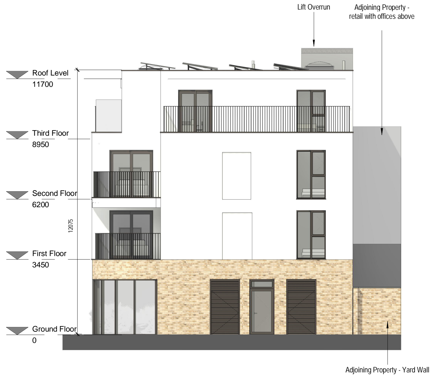
1 West Elevation 1 : 100

PLANNING NOTES 1. THIS DRAWING IS COPYRIGHT AND MUST NOT BE REPRODUCED IN WHOLE OR IN PART WITHOUT WRITTEN PERMISSION OF GAA DESIGN. 2. THIS DRAWING REPRESENTS DESIGN INTENT AND CONCEPT ONLY. HENCE IT CAN BE SCALED FOR PLANNING PURPOSES ONLY. 3. THIS DOCUMENT AND ALL ASSOCIATED DOCUMENTS ARE PREPARED FOR SPECIFIC SITE AND EVENT AND INCORPORATE CALCULATIONS AND MEASUREMENTS AVAILABLE FROM THE CLIENT AT THE TIME OF DRAWING. 4. THE RECIPIENT AGREES TO PROTECT THE CONTENTS FROM DISTRIBUTION AND DISSEMINATION EXCEPT AS REQUIRED FOR THE SPECIFIC EVENT NAMED, WITHOUT THE WRITTEN PERMISSION OF THE DESIGNER. 5. USE OF THIS DESIGN IS GRANTED TO THE CLIENT FOR THE SPECIFIC AND NAMED EVENT ONLY. COPYRIGHT © 2019