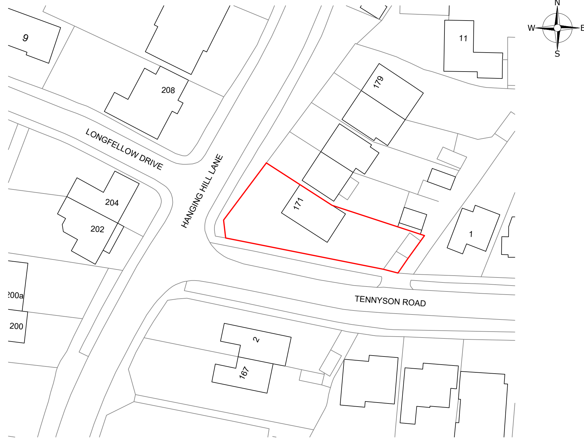
BLOCK PLAN SCALE 1:500 0 5 10 15 20m

Do not scale this drawing. Work to figured dimensions only. Check all dimensions on site. Confirm any discrepancies prior to commencement of work.