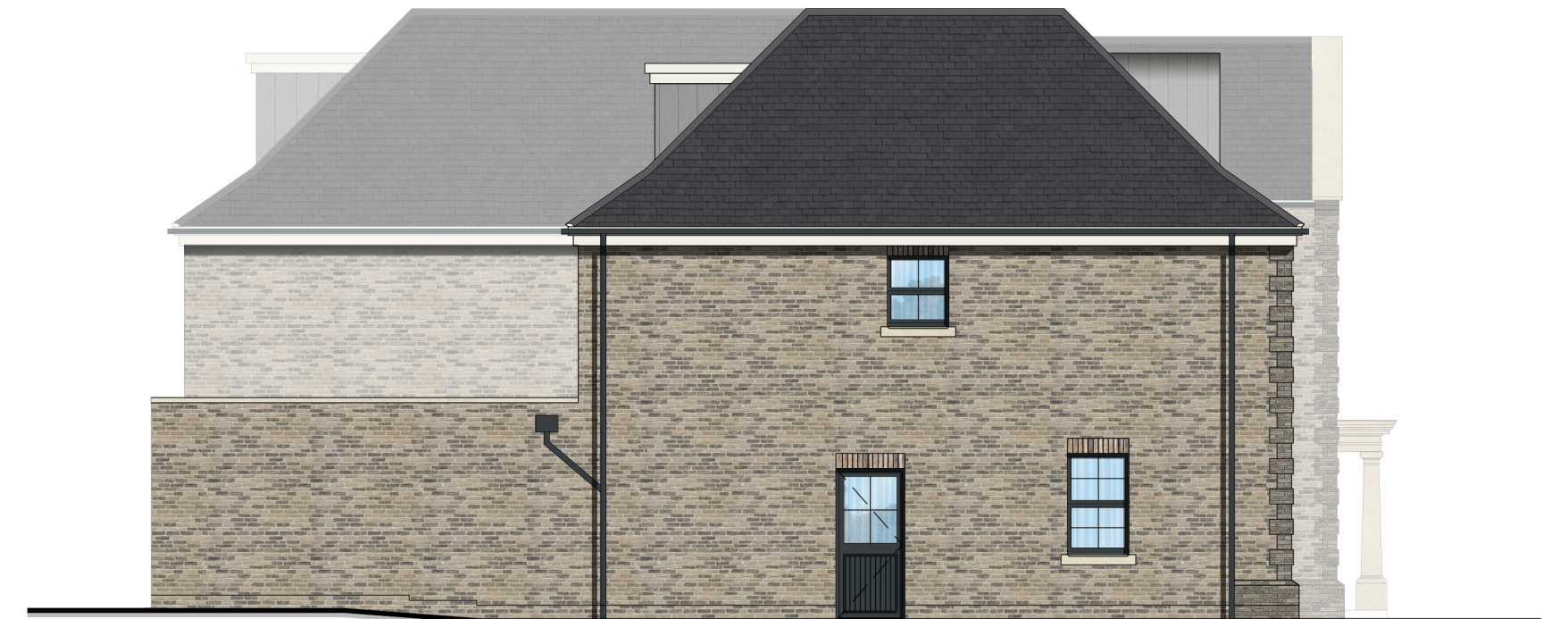
Side (North West) Elevation