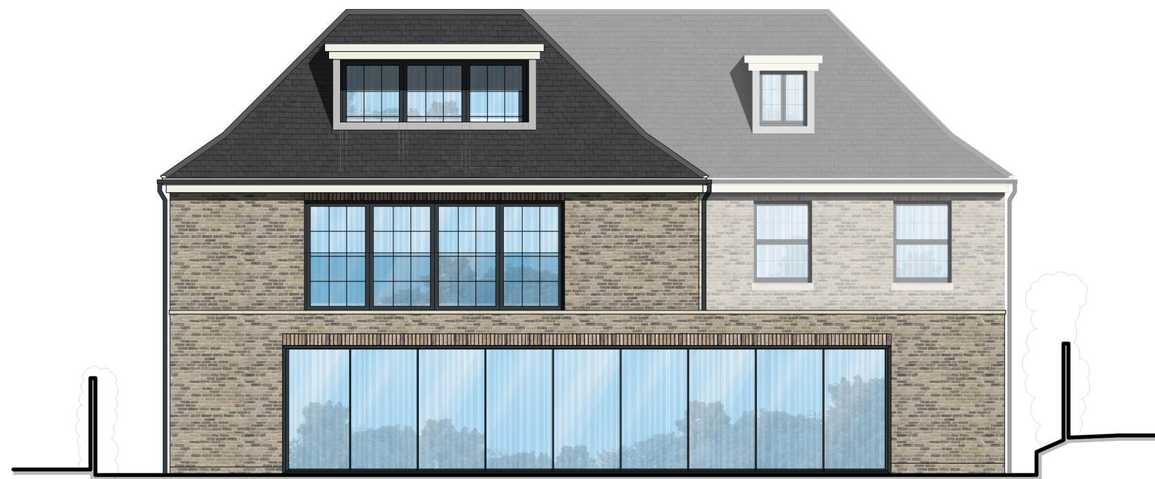
Rear (North East) Elevation