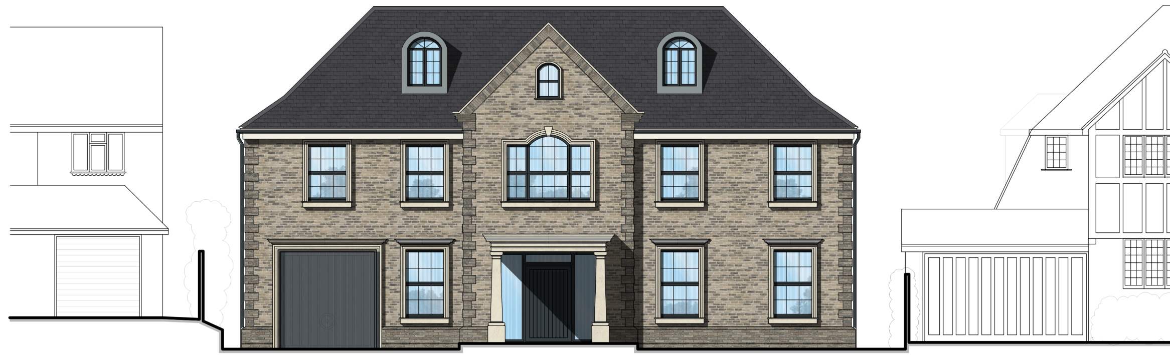
Front (South West) Elevation