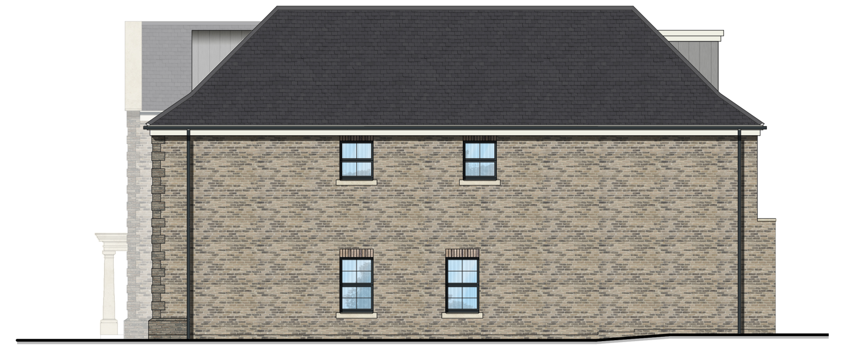
Side (South East) Elevation