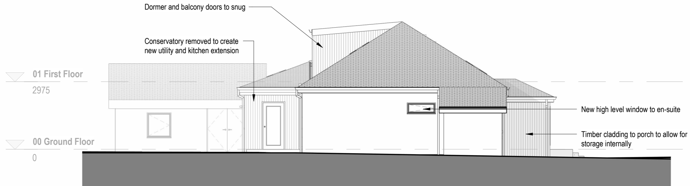
Left Gable Elevation