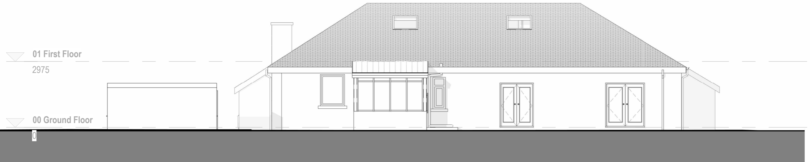
Rear Elevation (Existing)