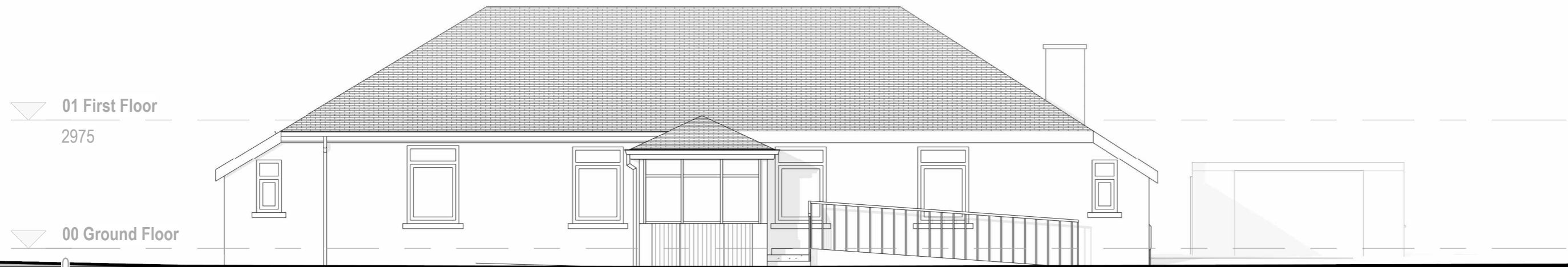
Front Elevation (Existing)