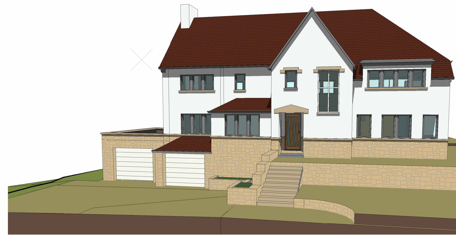
3D View - 2