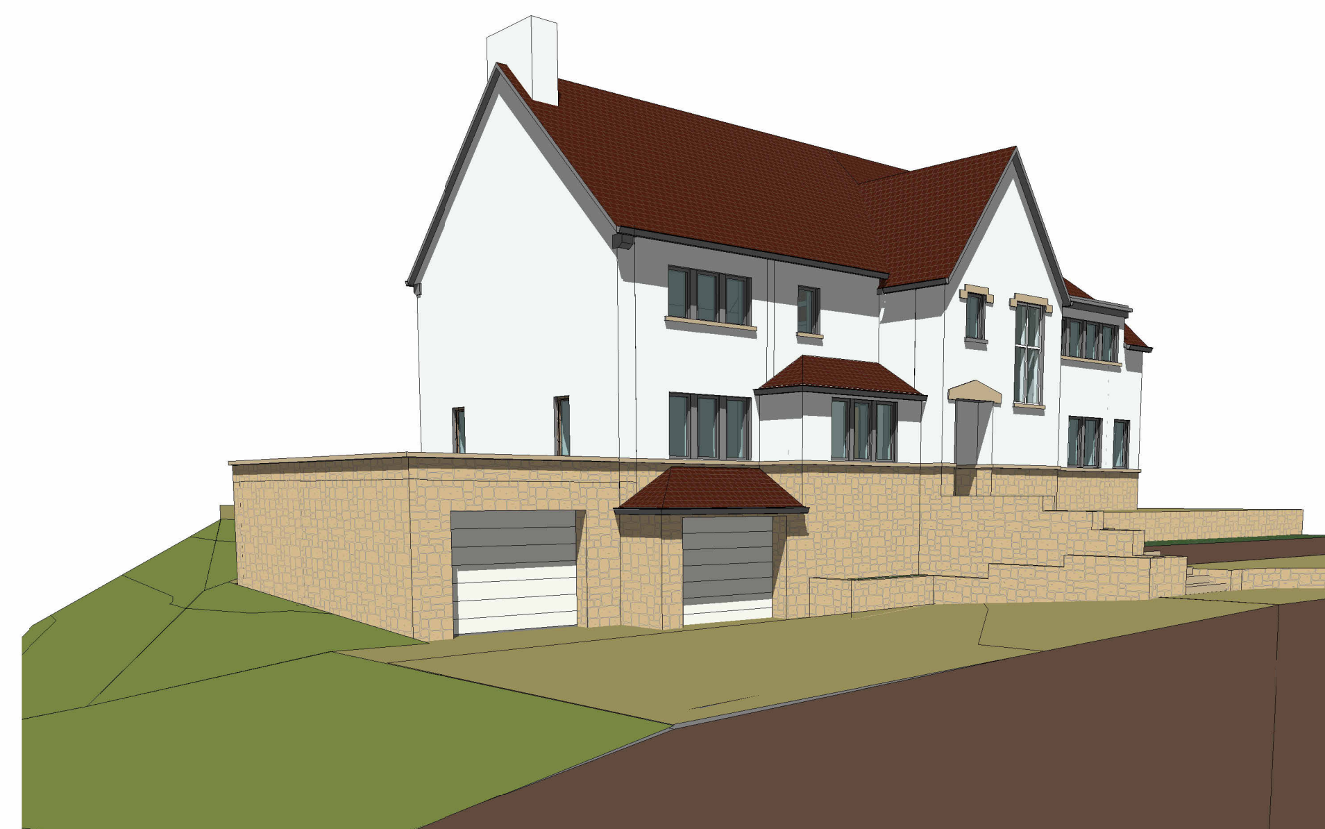
3D View - 1