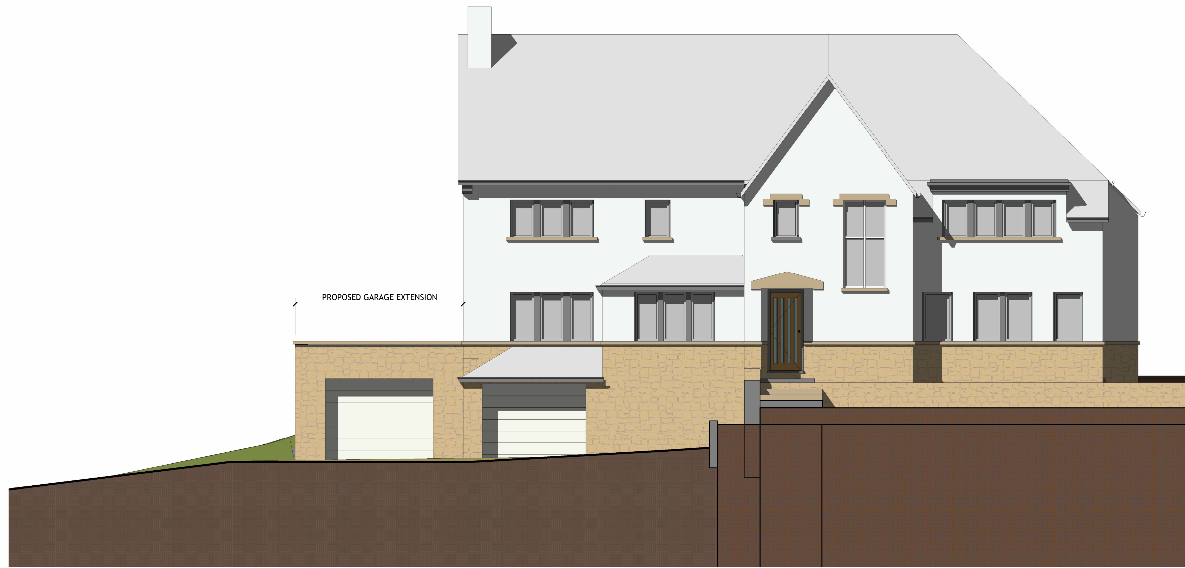
Front Elevation - to Creskeld Drive 1 : 50