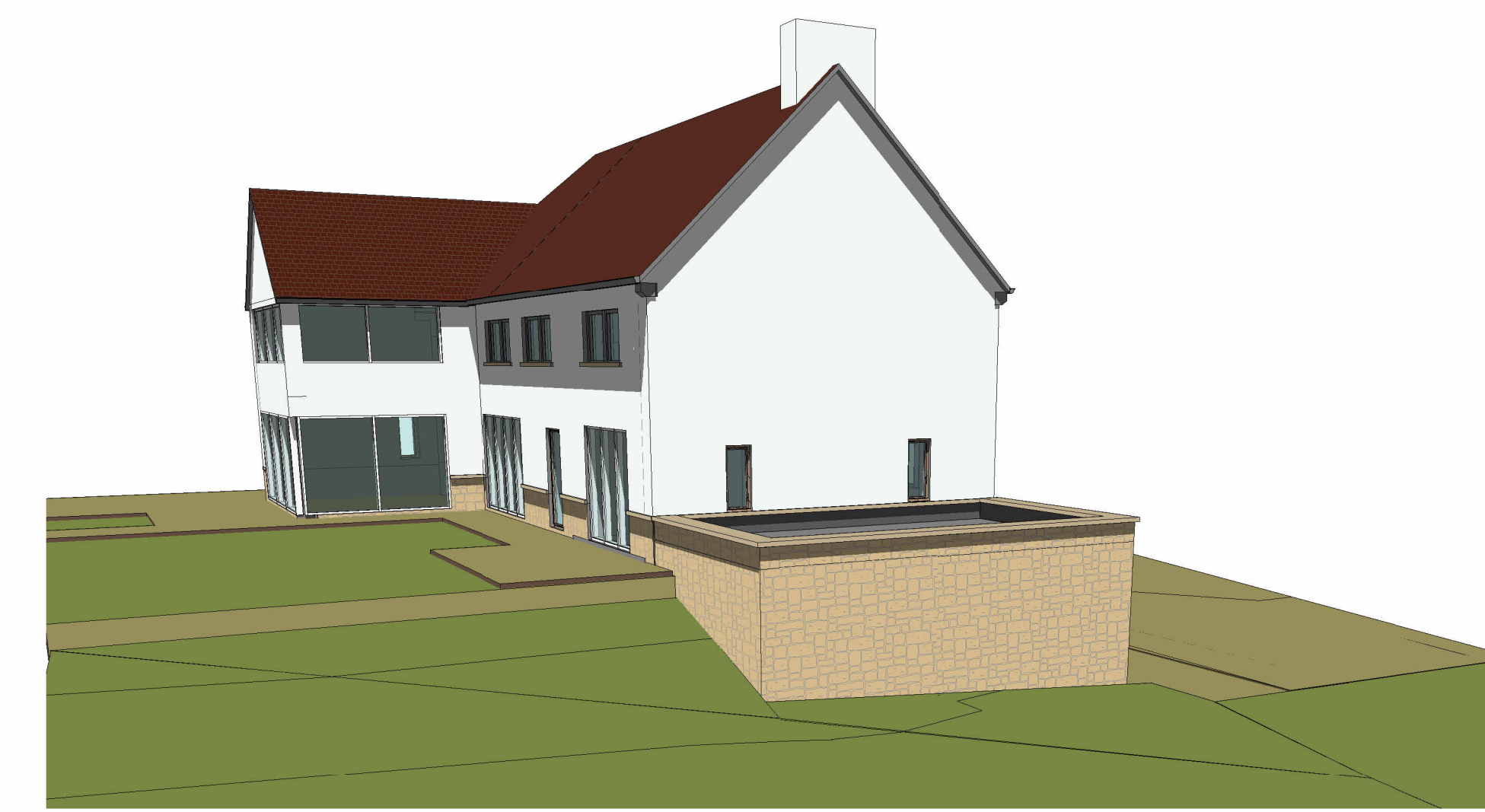
3D View - 3