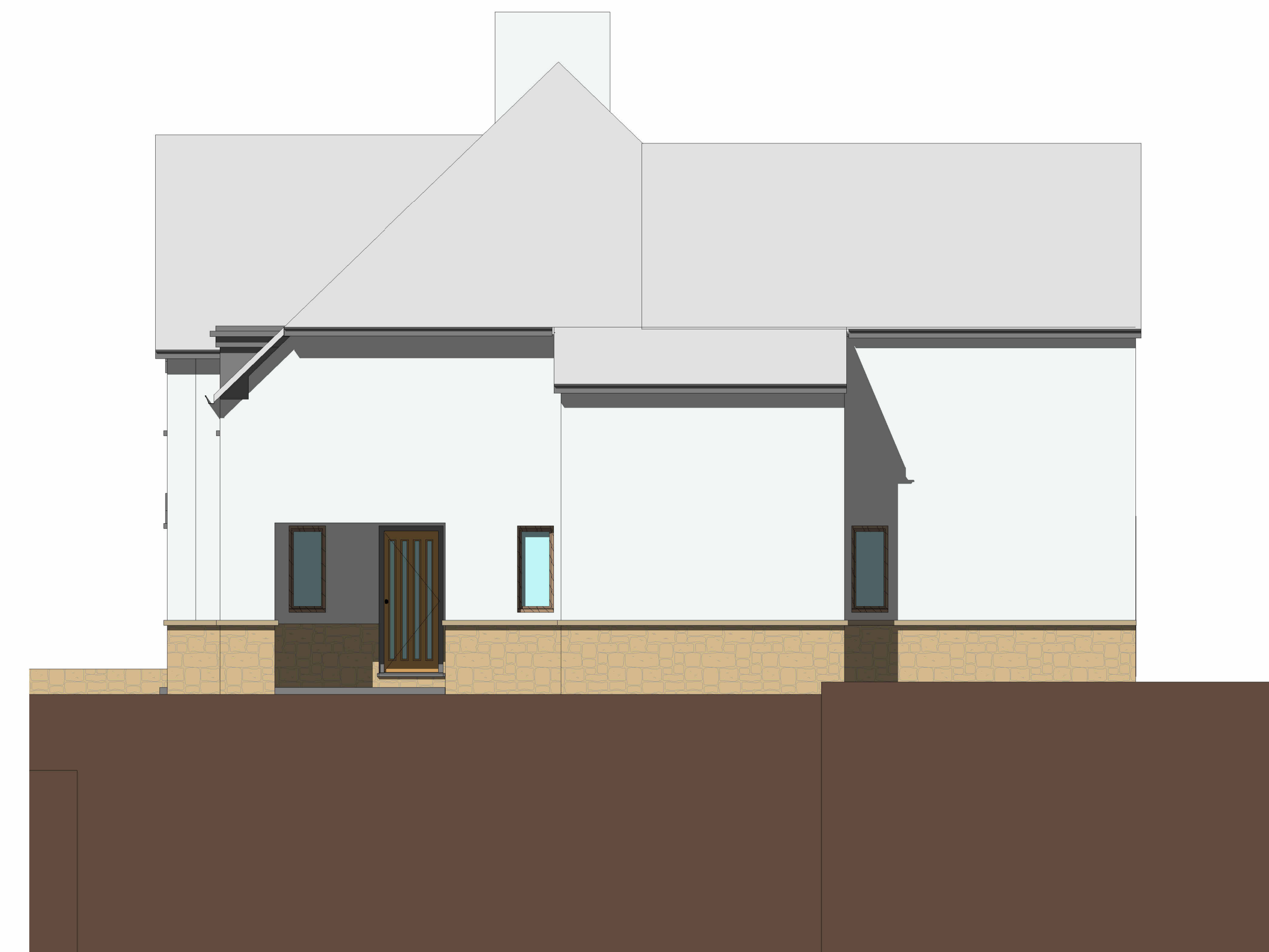
Side elevation - facing no. 14 Creskeld Drive 1 : 50