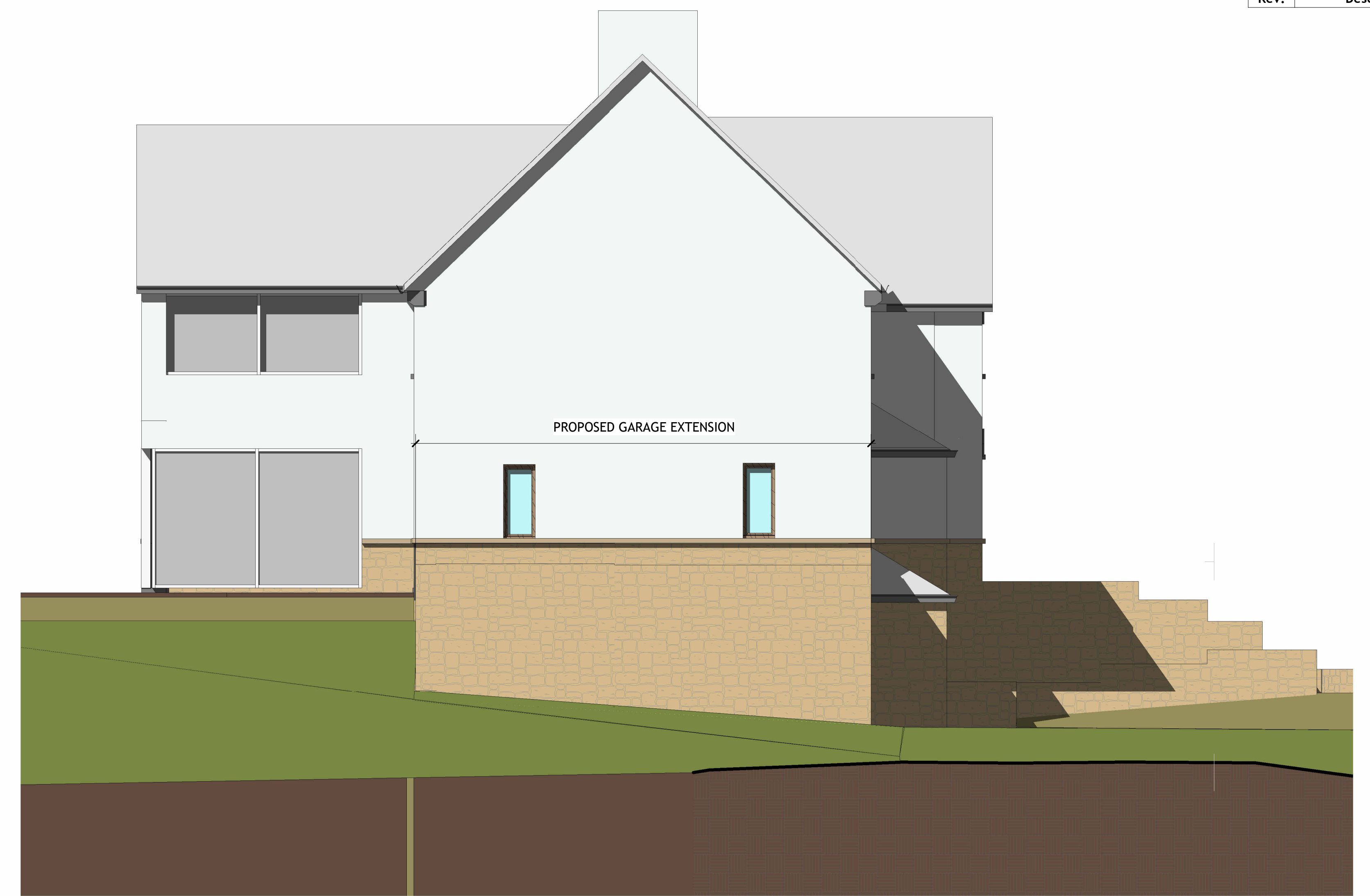
Side Elevation - facing no. 18 Creskeld drive 1 : 50