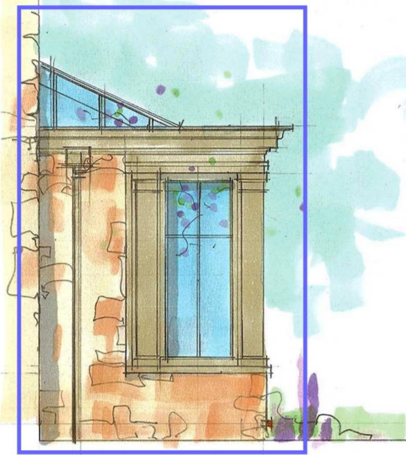
FOCUSED / PARTIAL NORTH ELEVATION