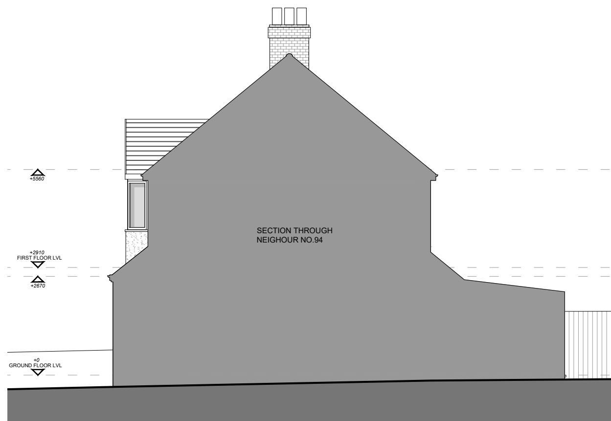
Existing Side Elevation (South) Scale 1:100