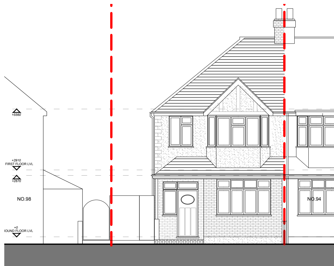
Existing Front Elevation (West) Scale 1:100

The proposed works will comply with the Part B of the current UK building regulations. A heat detector is proposed to the kitchen, and linked via mains to smoke detectors proposed to the hallways/landings at all levels of the property. The primary means of escape in the event of a fire will be via the main entrance to the property. The proposed Evacuation and Assembly point will be on the footpath on the road front, distanced away from the property, and accessed via the primary means of escape. The existing road will provide suitable access and appliances/equipment for fire fighting purposes. The proposed works do not affect this provision.