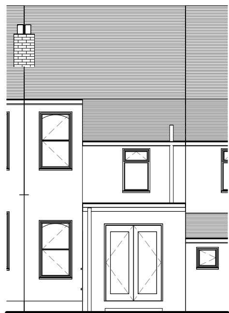
Proposed Rear Elevation. 1 : 100

The external materials of the proposed extension would match the external materials of the original dwelling house