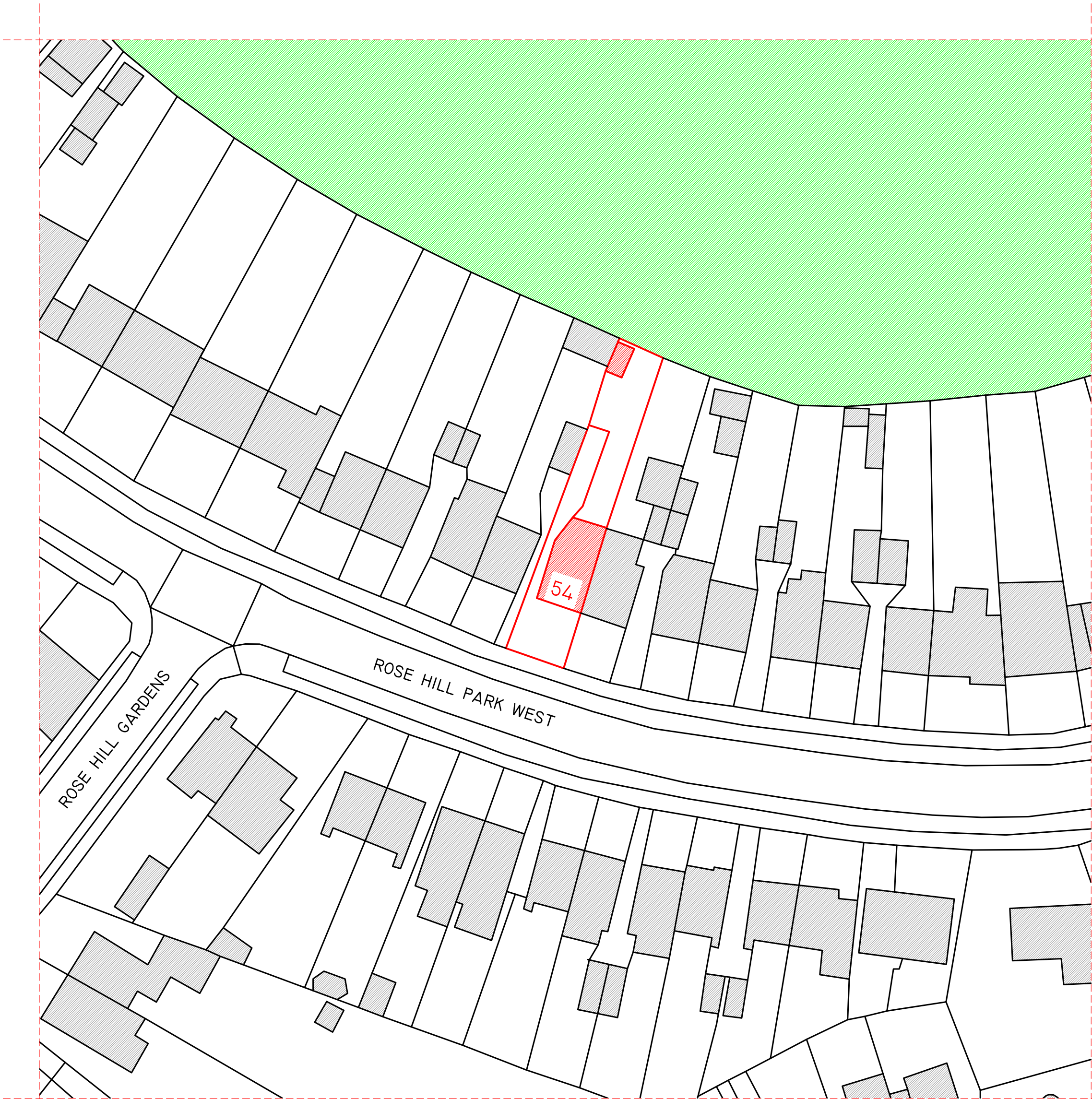
BLOCK PLAN OF THE SITE, EXISTING PLAN, SCALE 1:500