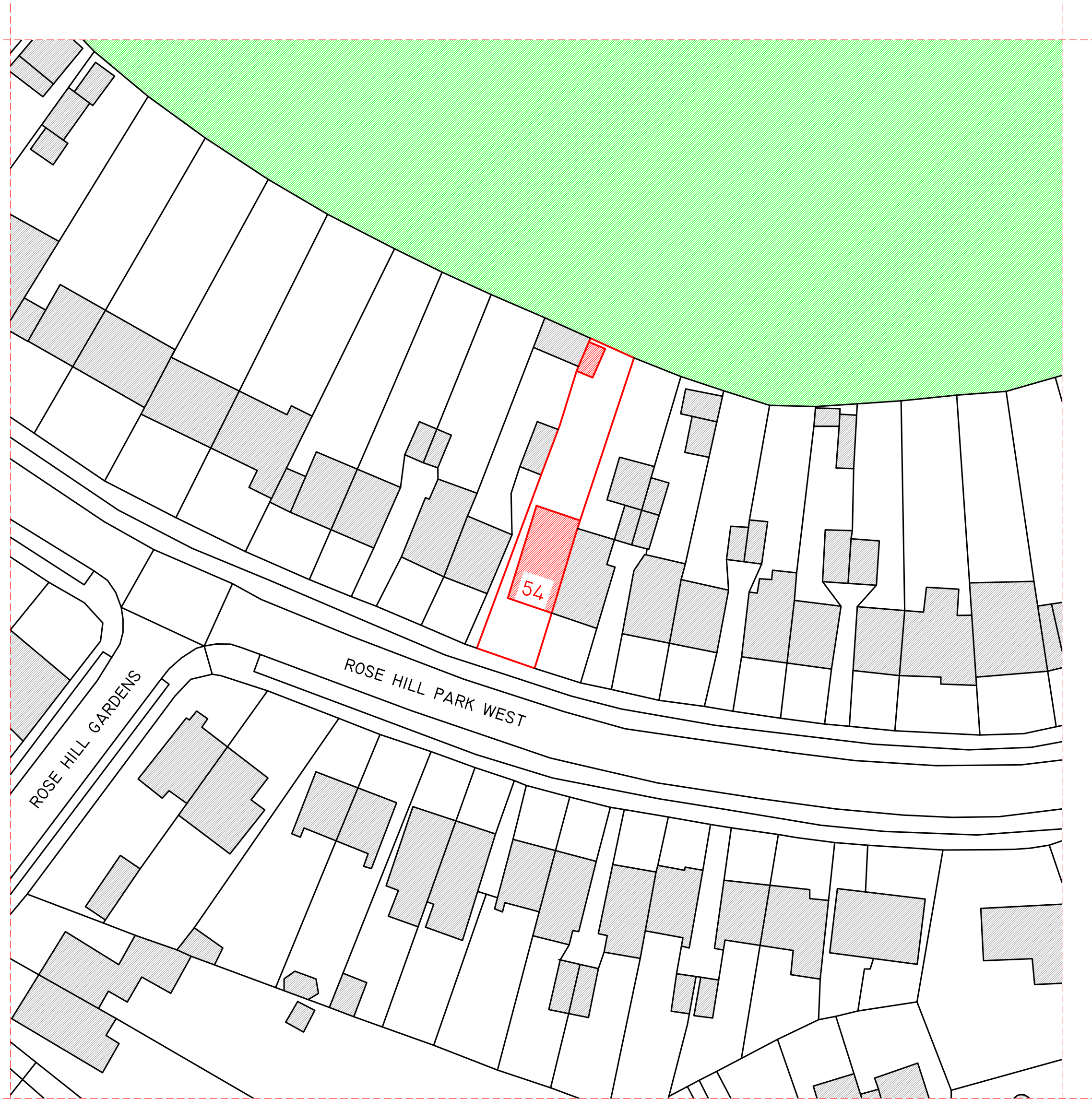
BLOCK PLAN OF THE SITE, PROPOSED PLAN, SCALE 1:500