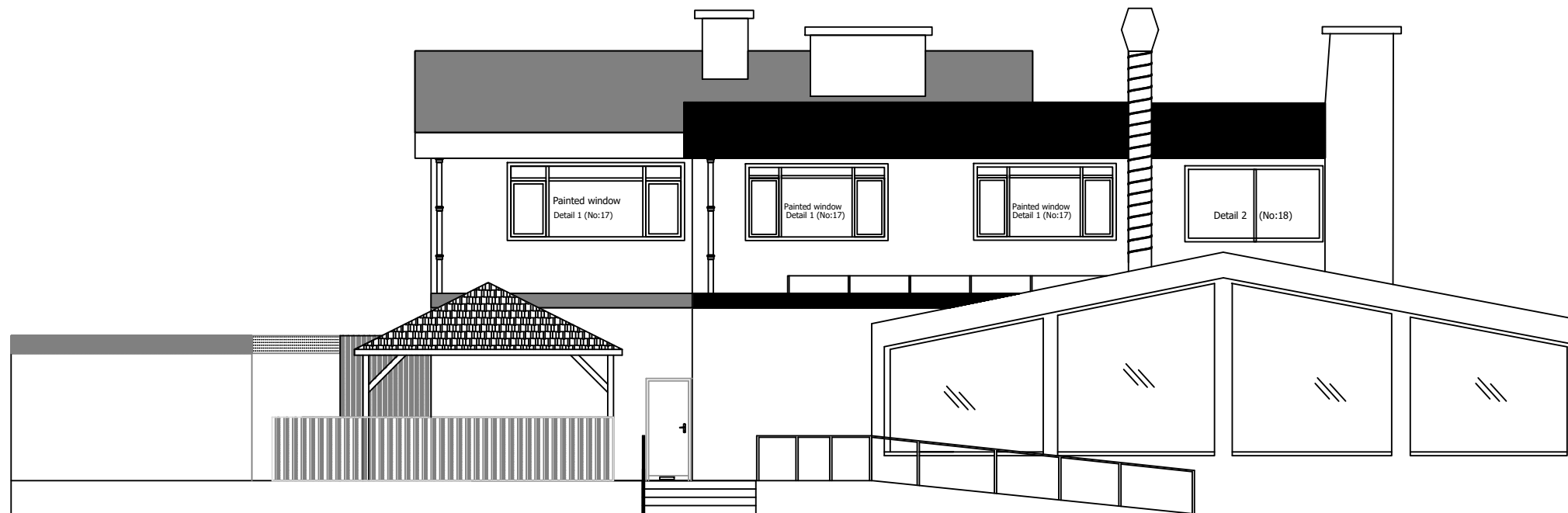
Pre Existing Rear View