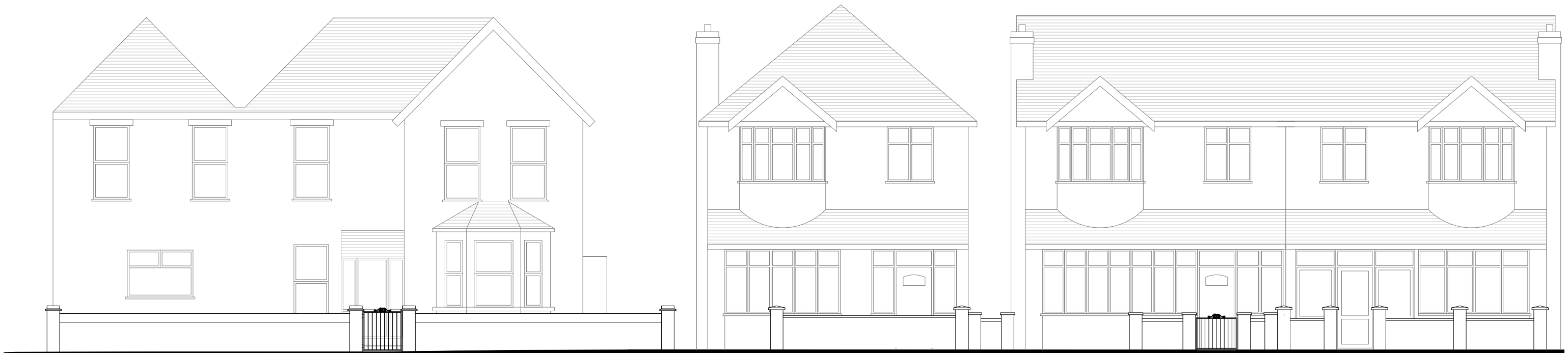
PROPOSED STREET SCENE