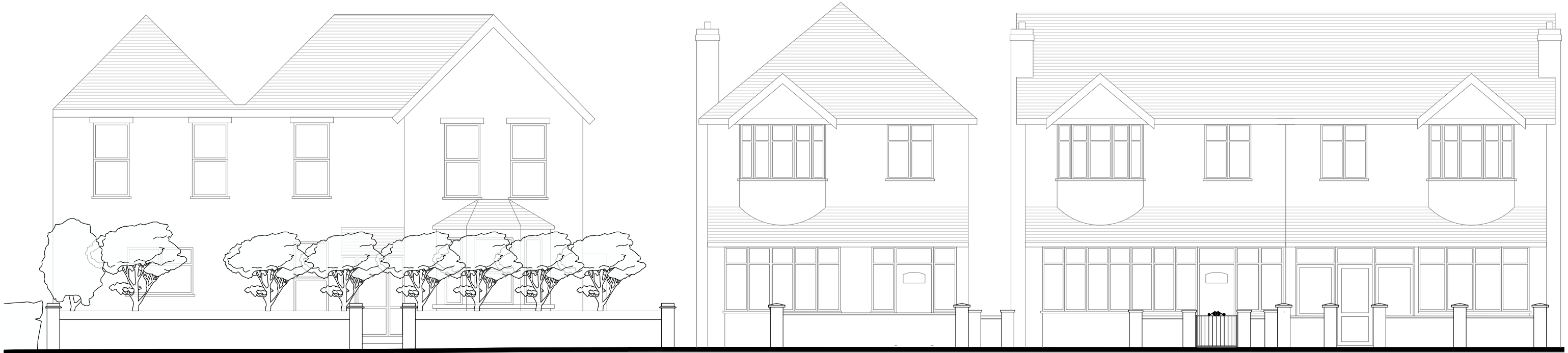
EXISTING STREET SCENE