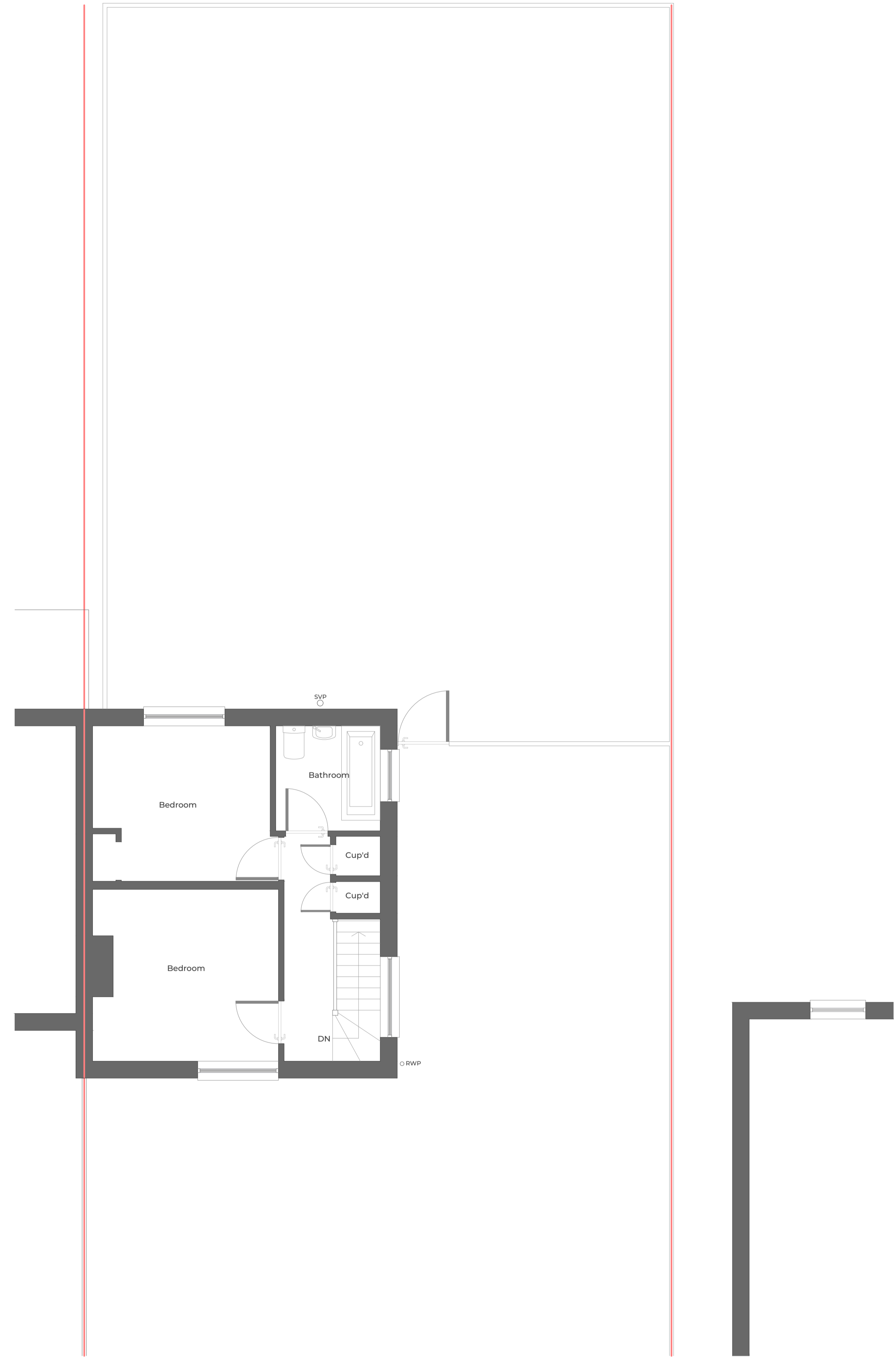
Existing First Floor Plan 1:50