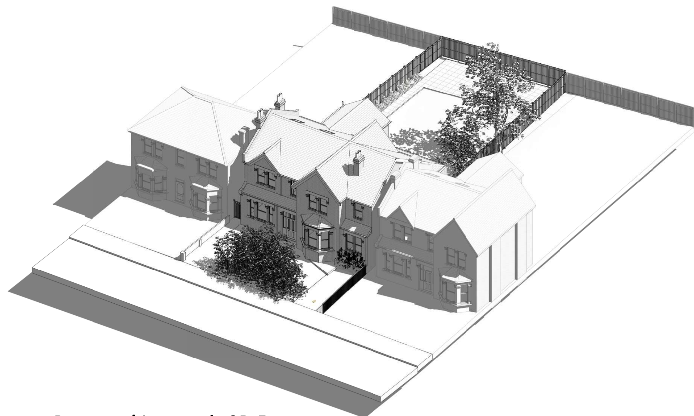
1 Proposed Isometric 3D Front