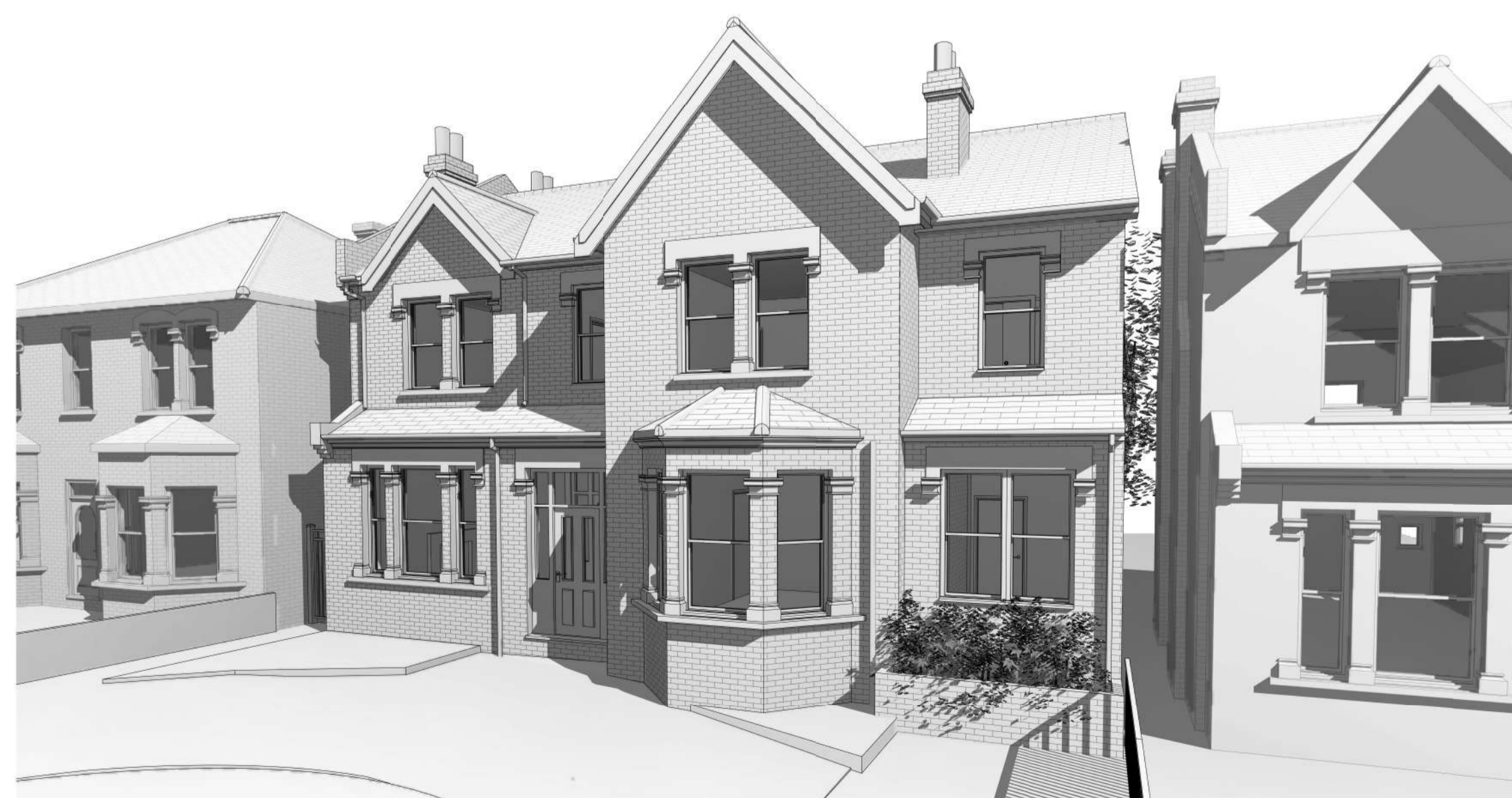
3 Proposed 3D Front View