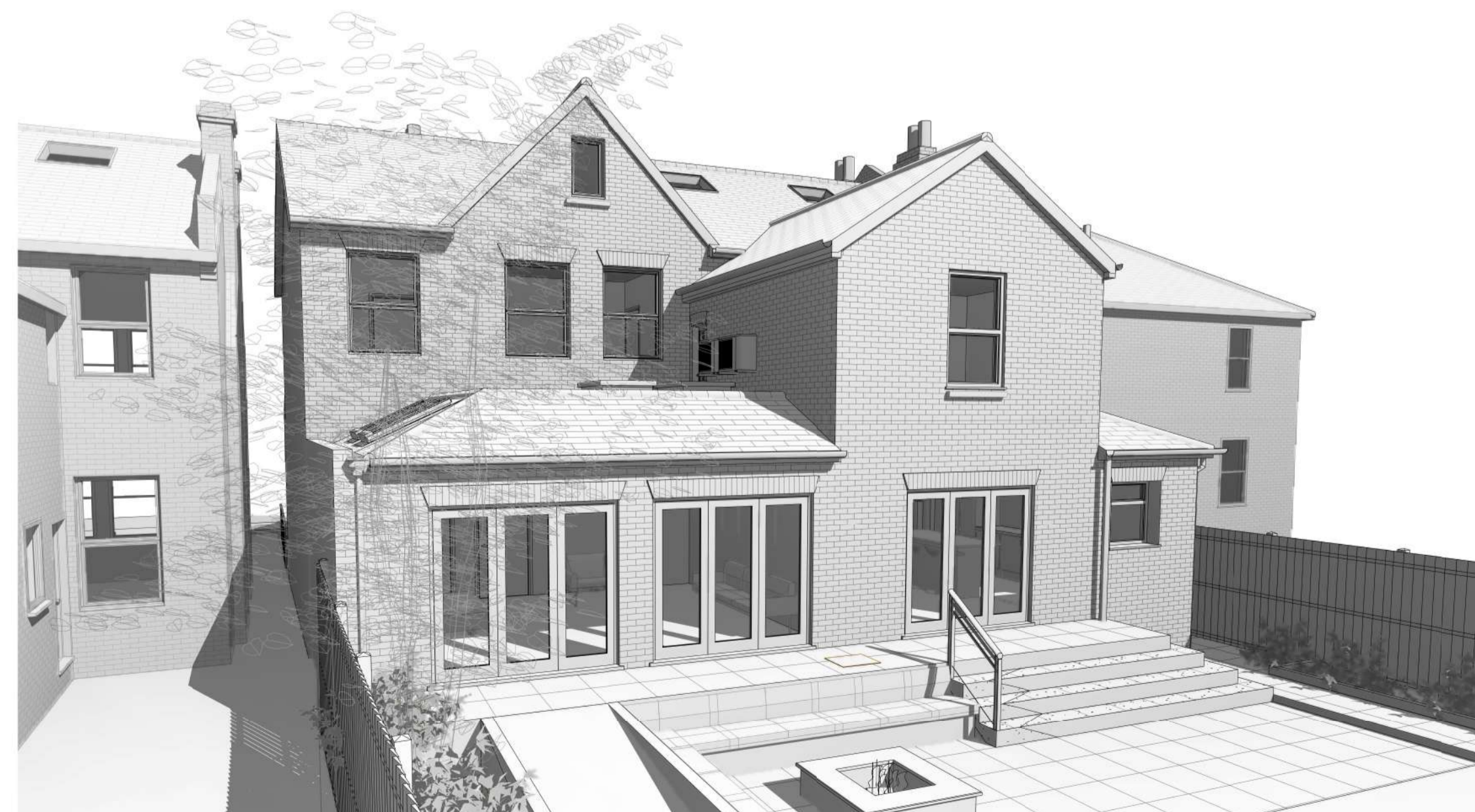
4 Proposed 3D Rear View