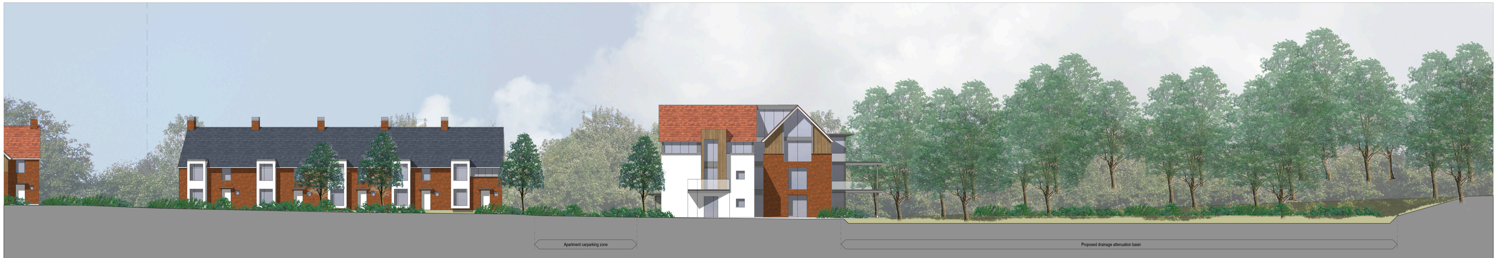
Proposed Site Section A-A 1:200 Part Two