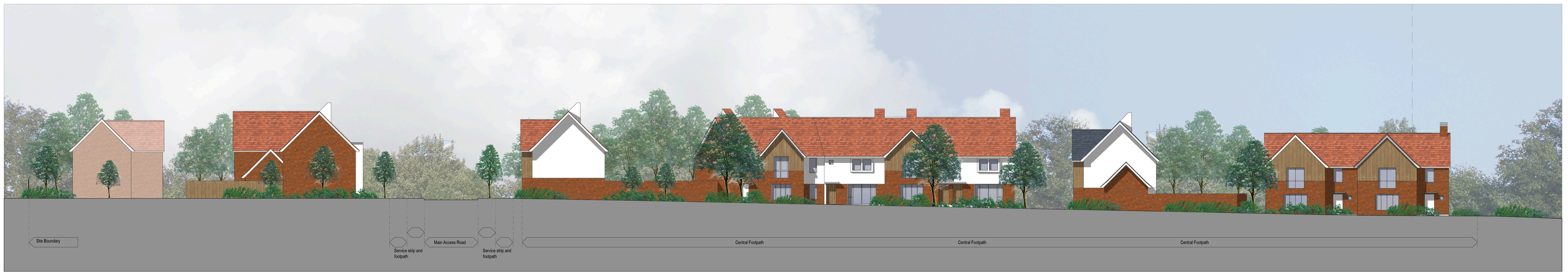
Proposed Site Section A-A 1:200 Part One