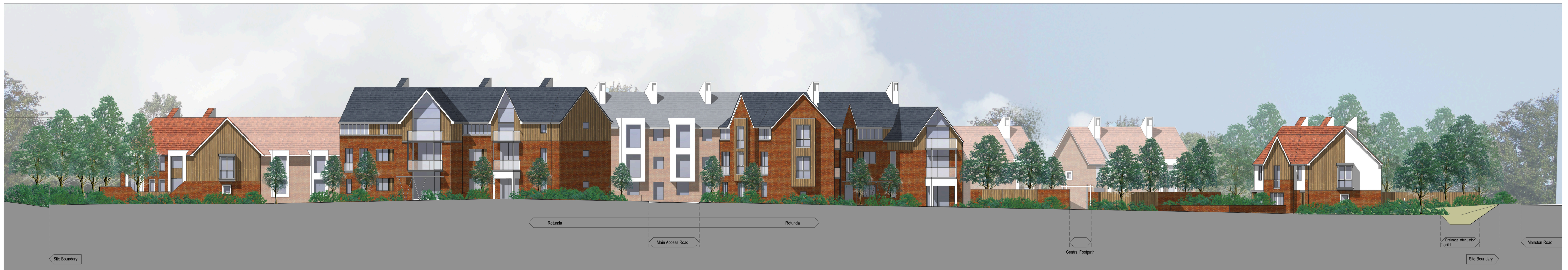
Proposed Site Section B-B 1:200