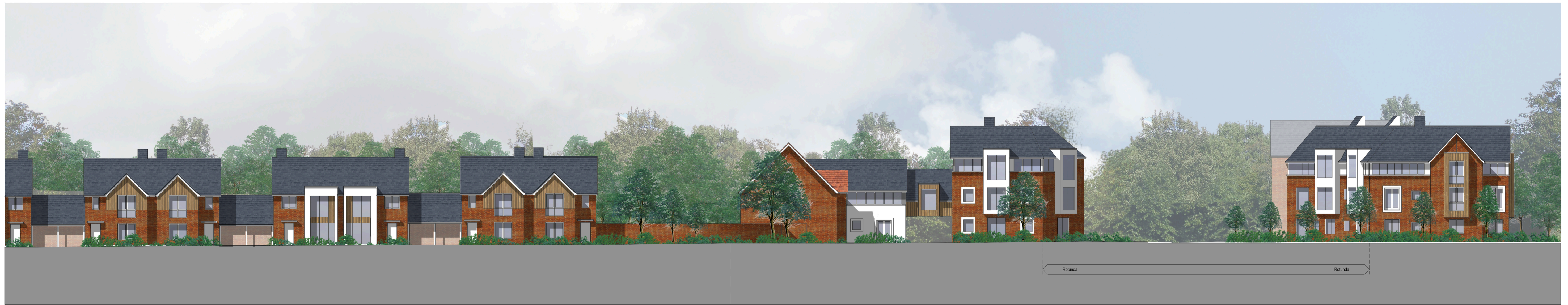
Proposed Site Section C-C 1:200 Part Two