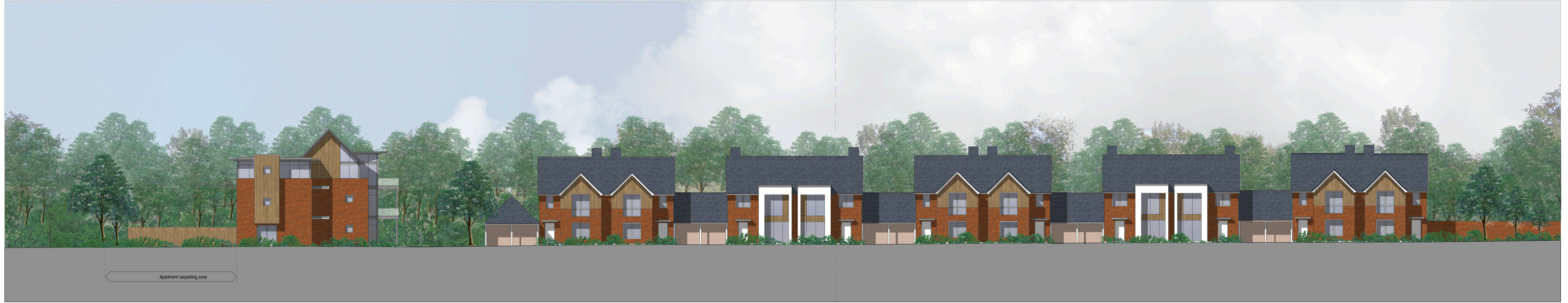
Proposed Site Section C-C 1:200 Part One