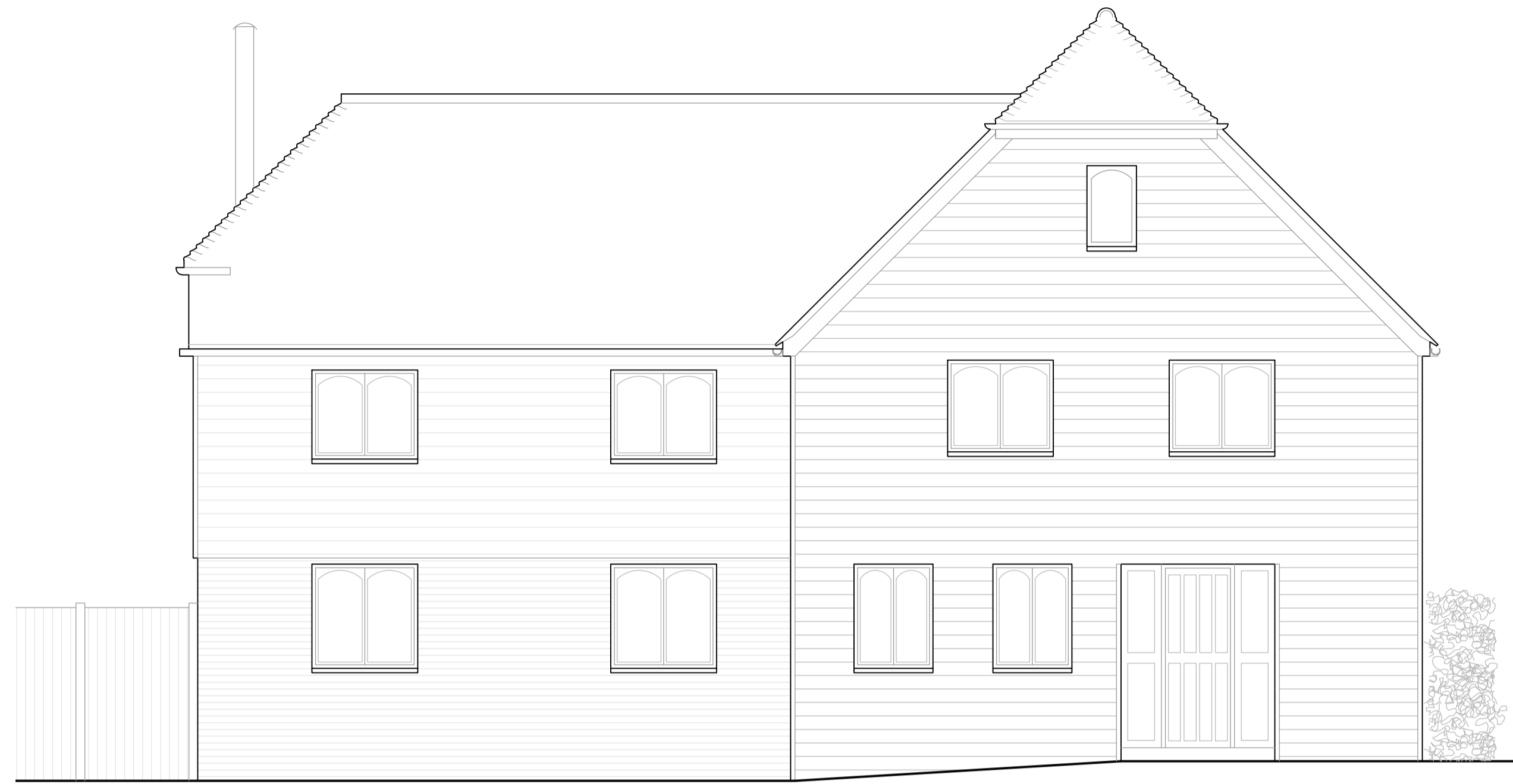
EXISTING EAST ELEVATION SCALE 1:50