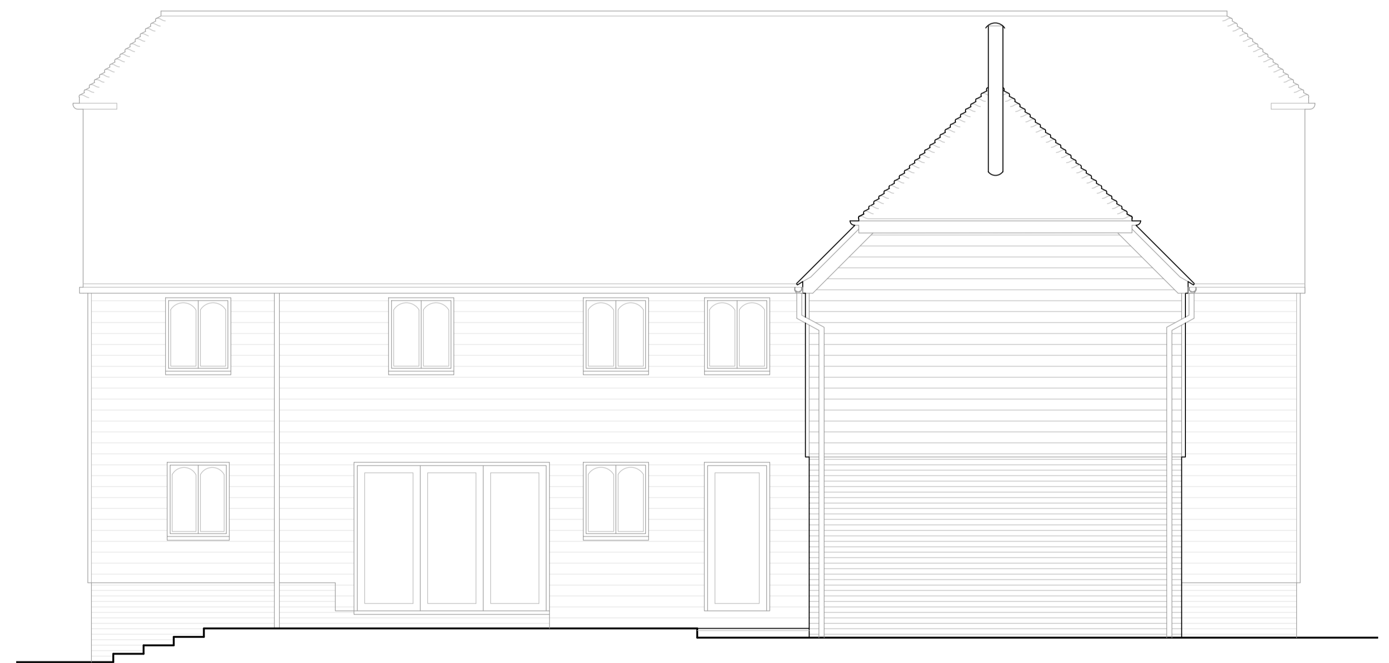
EXISTING SOUTH ELEVATION SCALE 1:50

Notes Do Not Scale (unless for the purposes of planning). Report all discrepancies, errors and omissions. Verify all dimensions on site before commencing any work on site or preparing shop drawings. All materials, components and workmanship are to comply with the relevant British Standards, Codes of Practice, and appropriate manufacturers recommendations that from time to time shall apply. For all specialist work, see relevant drawings. This drawing is copyright of Kent Design Studio Ltd