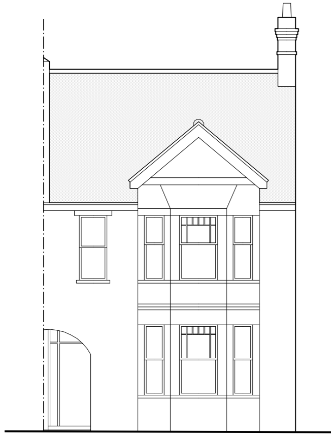
Proposed Front Elevation (West)