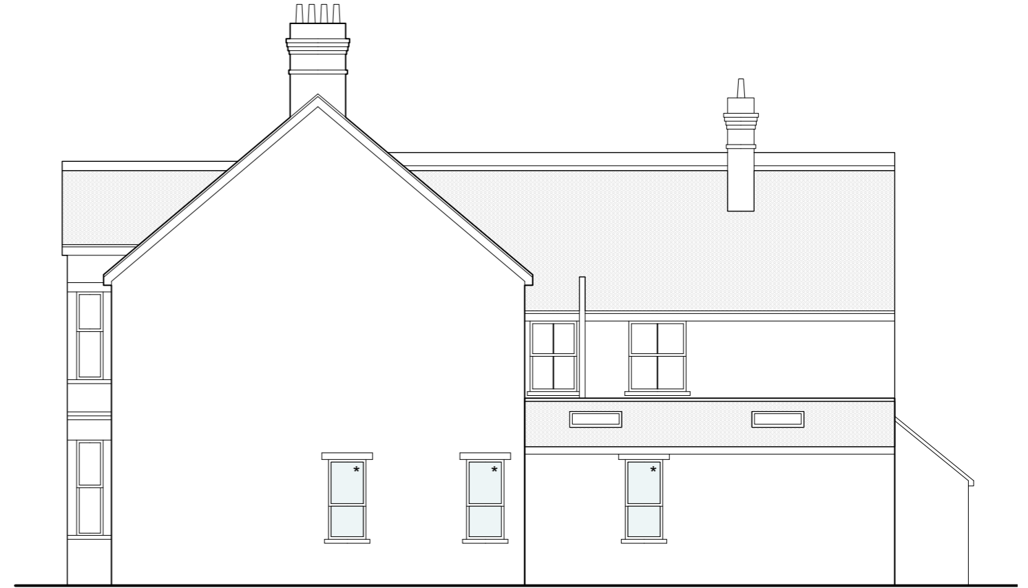
Proposed Side Elevation (South)