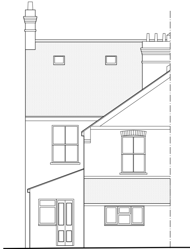
Proposed Rear Elevation (East)