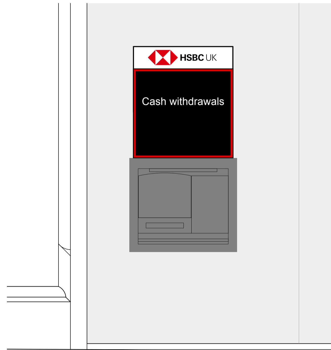
01 Detailed Elevation Of Affected Area 1:25@A3 / 1:12.5 @ A1