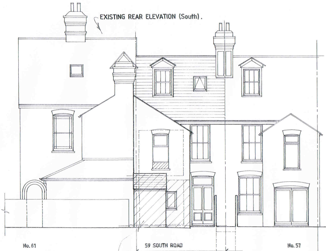
EXISTING REAR ELEVATION (South).