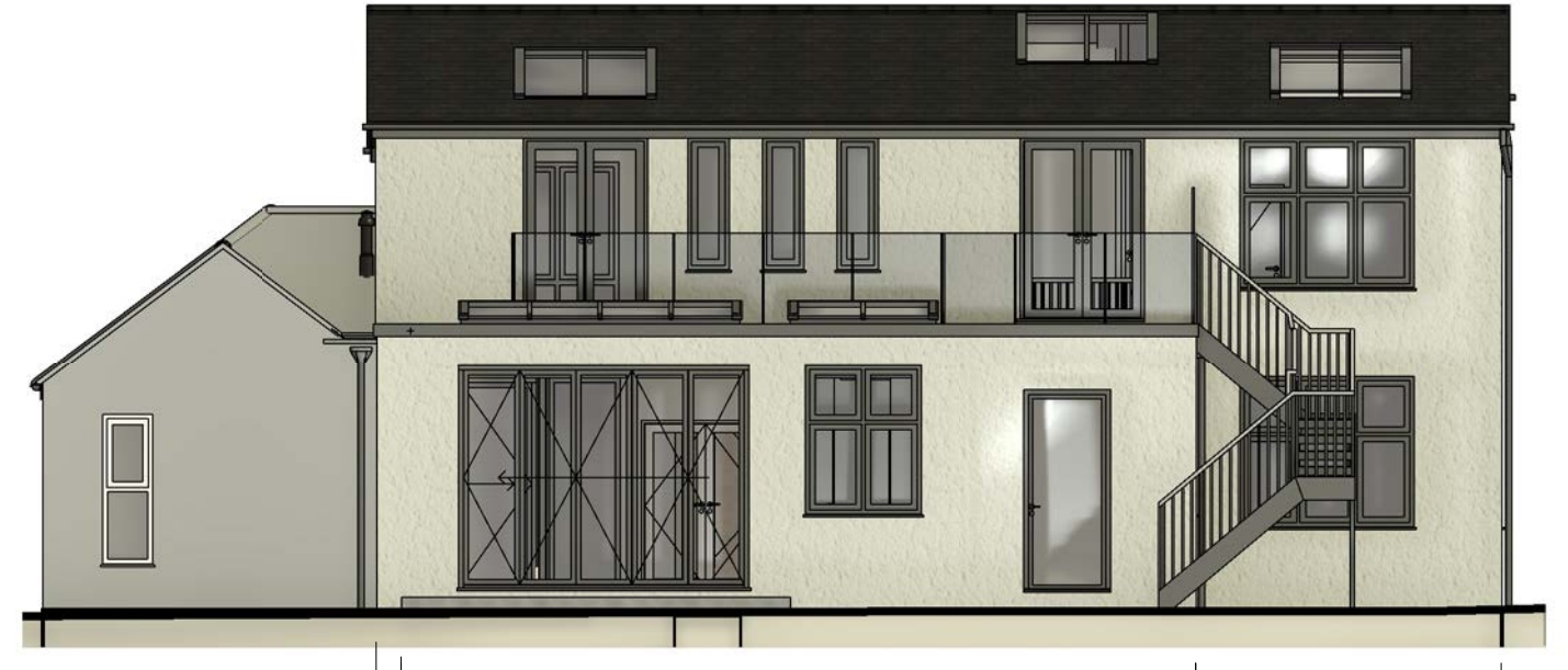
Proposed Rear (NNW) Elevation 1 : 100