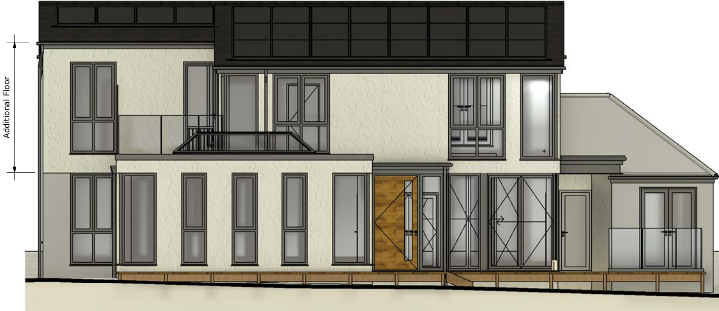
Proposed Front (SSE) Elevation 1 : 100